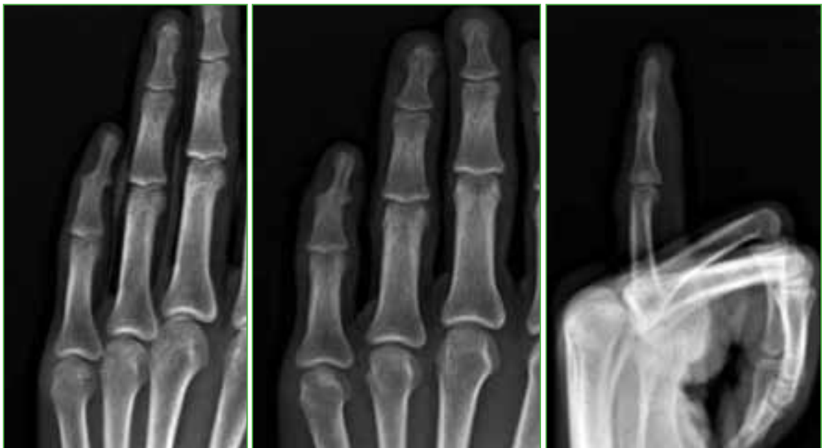
Figure 6. X-ray, 2 months after surgery. X-ray showing consolidation of the distal interphalangeal joint arthrodesis.