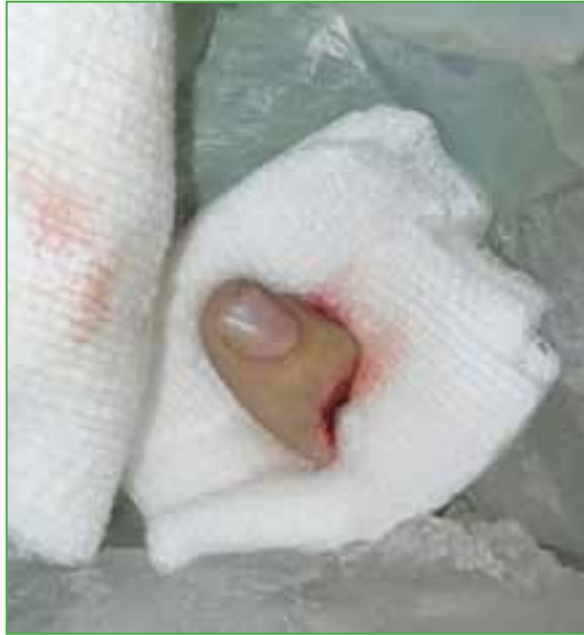
Figure 2. Amputated segment, correctly preserved in a container cooled with ice and damp cloths.

The patient was immediately transferred to the operating room for replantation (Figure 3). Digital block anesthesia (local) was administered, and surgical toilet and arthrodesis with two 1-mm intramedullary Kirschner wires were performed (Figure 4). Flexor tenorrhaphy and extensor tenorrhaphy were then performed, and, finally, neurovascular sutures were performed under microscopic magnification (3.5 times). Following the neurovascular sutures using Ethilon suture 9-0, arterial anastomosis was successfully performed using the same suture. Immediately after the arterial anastomosis, the patient received intravenous heparin sodium 70 U/kg of body weight. A venous anastomosis was then attempted, which was unsuccessful due to wound damage and small venous caliber. As a result, the decision was made to remove the nail plate and to place heparin-impregnated gauze (5000 IU heparin sodium) in the nail bed, with dressing changes at 3-hour intervals. No paraungual incisions were made for external bleeding. The total surgical time was 150 minutes.