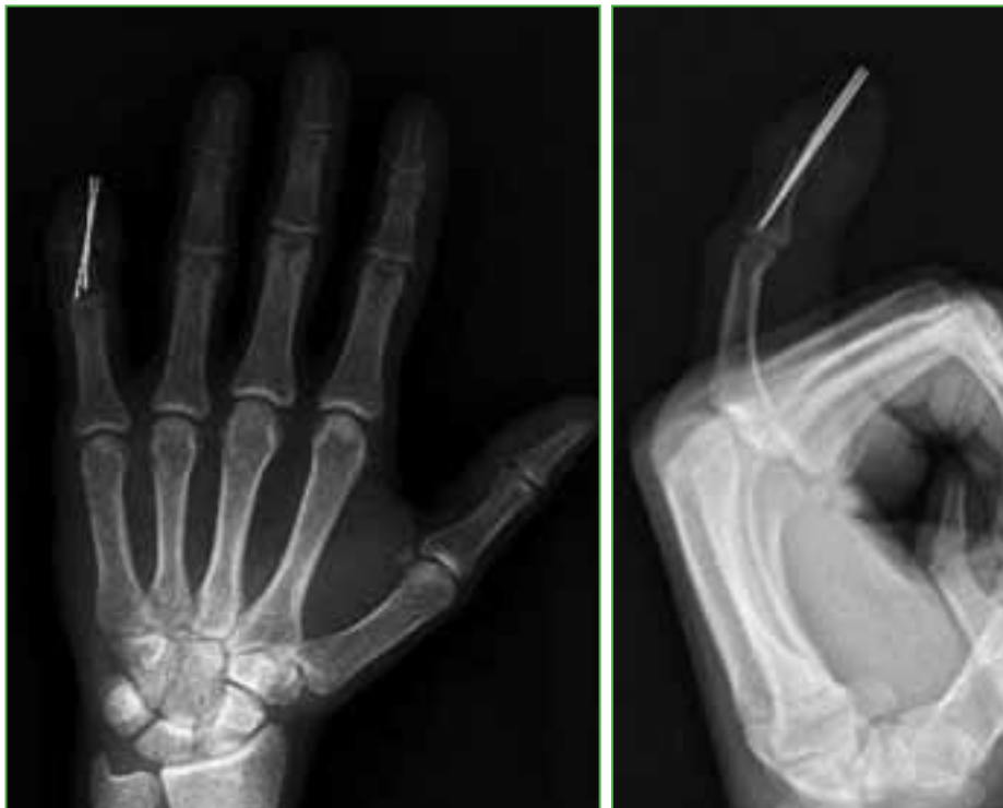
Figure 4. Temporary arthrodesis with two 1-mm intramedullary Kirschner pins.