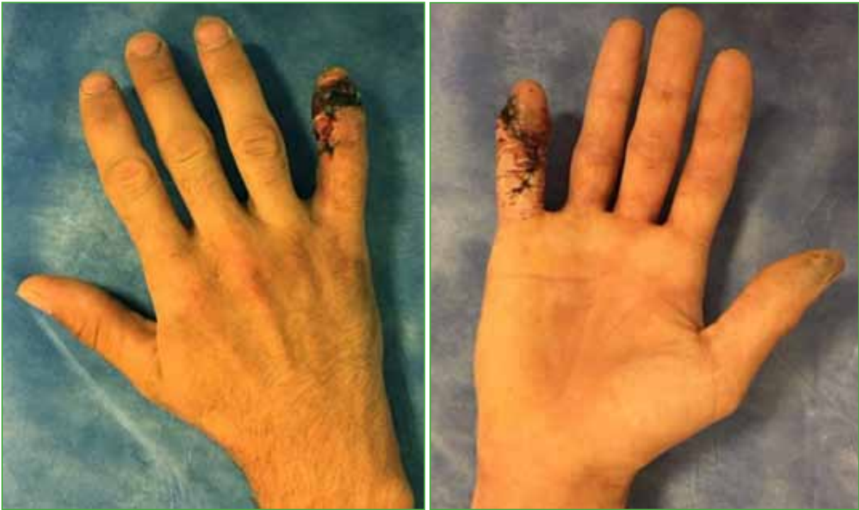
Figure 5. Replanted fifth digit tip, three weeks after surgery.