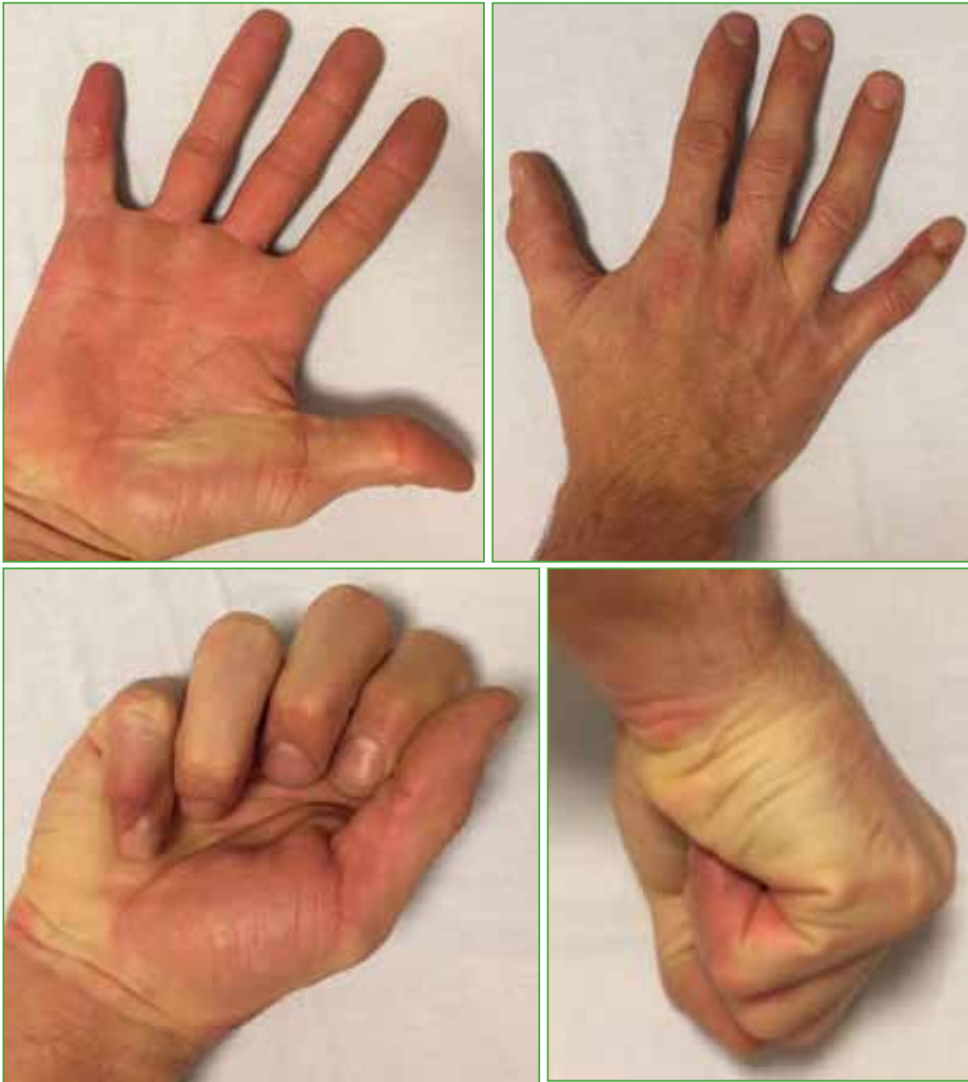
Figure 7. Sixty-day control. Complete recovery of the metacarpophalangeal and proximal interphalangeal joints, and mild deviation in pronated replanted segment.