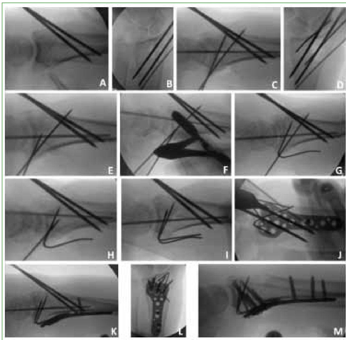
Figure 2. Fluoroscopic view during the procedure. A and B. Metaphyseal fracture per-cutaneous reduction using intra-focal pinning. C and D. Additional pins in the volar marginal fragment. E-G. Partial removal and bending of pin using a needle-holding forceps. H and I. Partial removal and bending of the additional pin using a needle-holding forceps. J and K. Metaphyseal volar plate fixation over the bent pins. L and M. Intra-focal pin removal and final fixation with all screws placed over the additional pins.