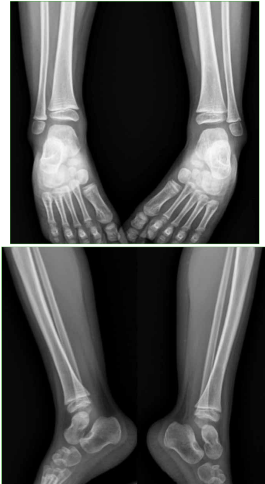
Figure 5. Both ankle anteroposterior and lateral X-rays, 2 years and 6 months after the intervention.