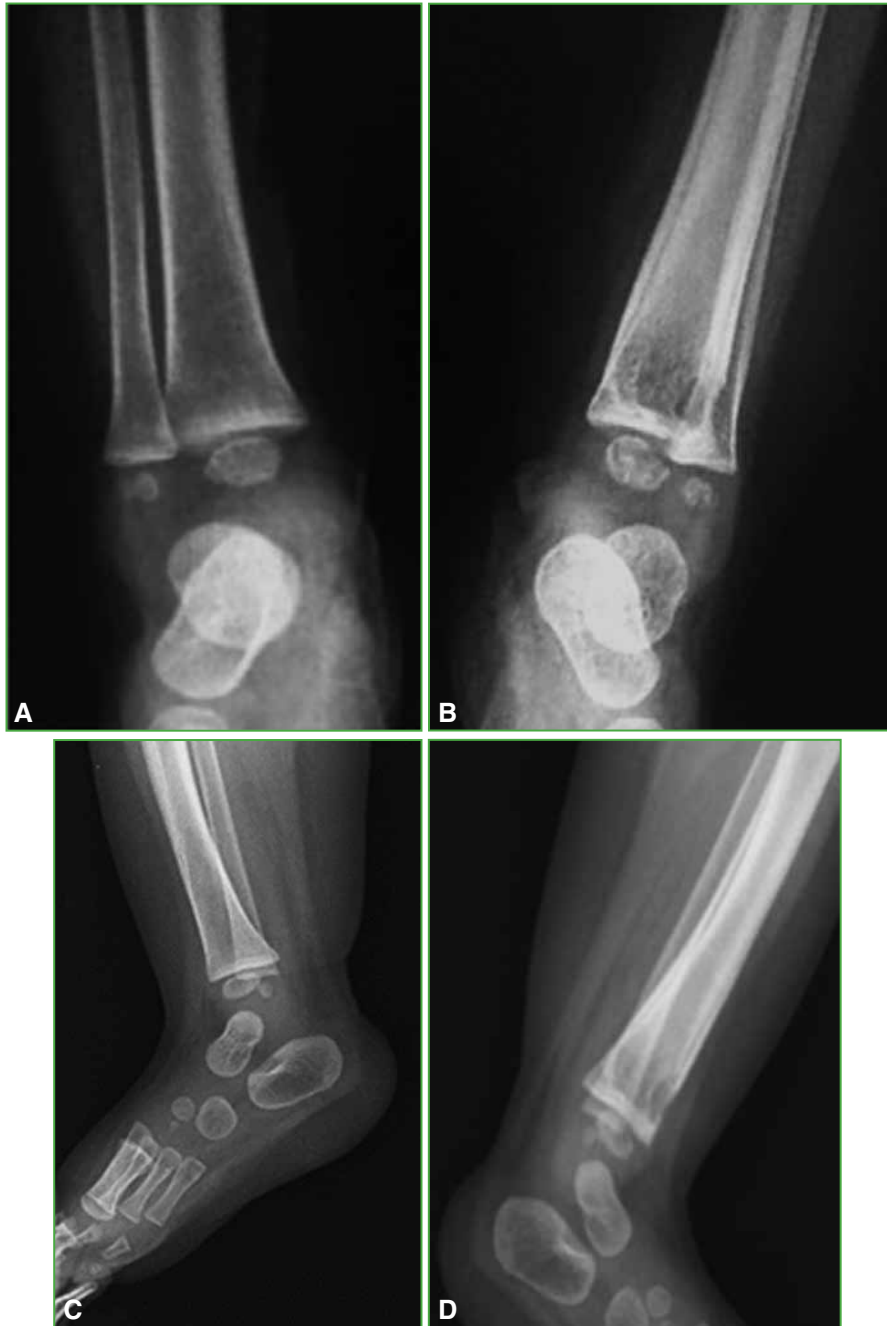
Figure 1. Both ankles anteroposterior and lateral X-rays. B and D. X-rays evidence osteolytic lesion in the distal metaphysis of the left tibia.