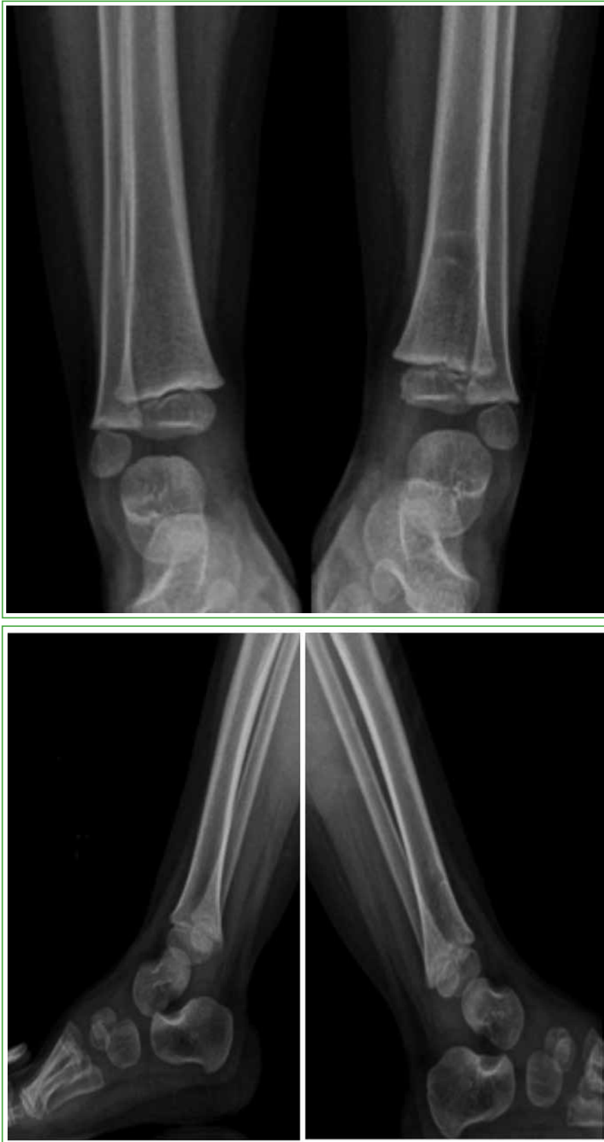
Figure 3. Both ankles anteroposterior and lateral X-rays, 1 year after the intervention.