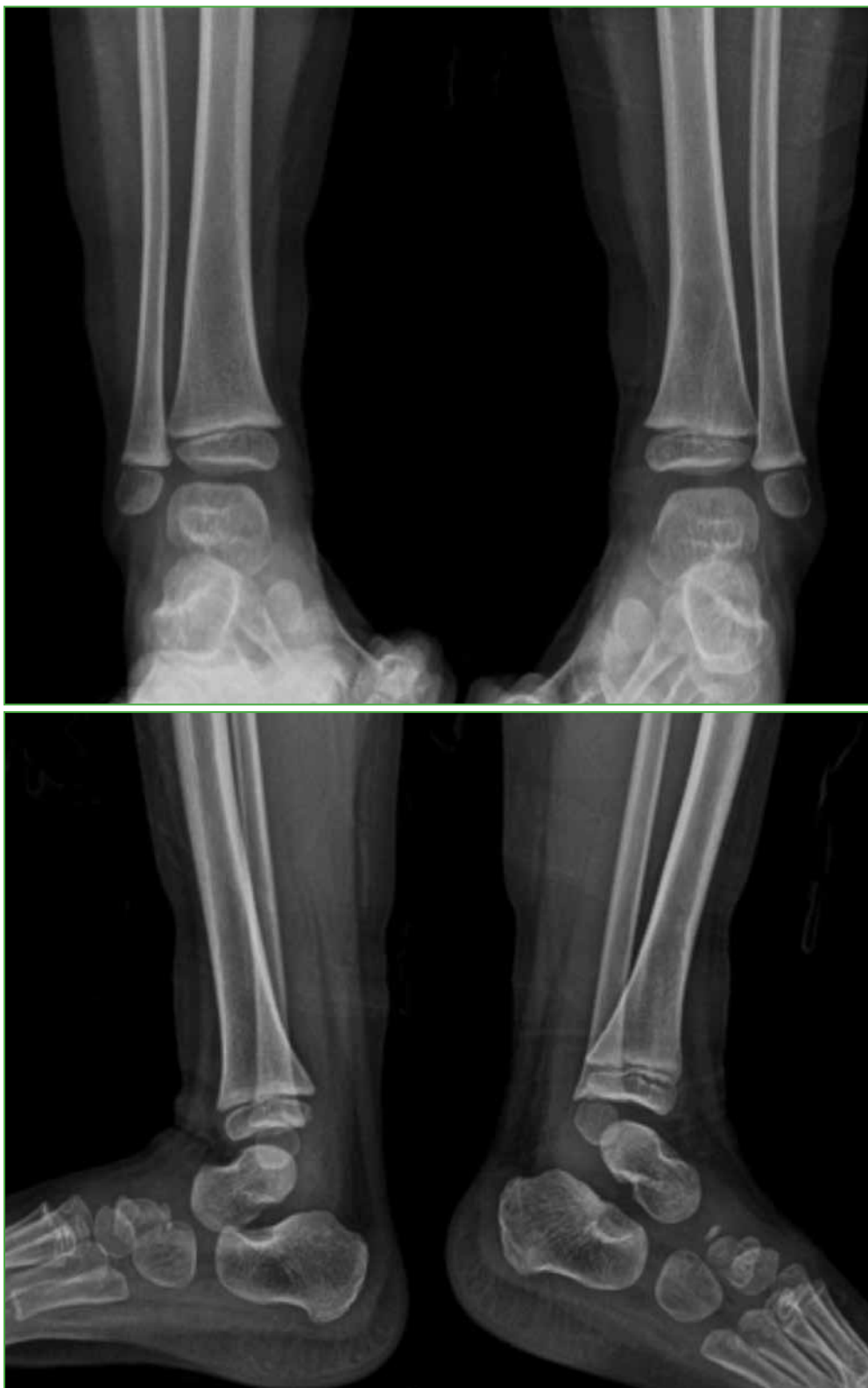
Figure 4. Both ankles anteroposterior and lateral X-rays, 2 years after the intervention.