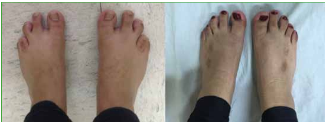
Figure 5. Pre- and postoperative images. We can observe adequate-length and uniform-looking toes.

According to published studies, cosmetics are the main reason for patients requesting surgery; therefore, bone lengthening with an external fixator would have an additional advantage over one-stage lengthening: the incision is smaller and, therefore, the scar is more aesthetic (Figures 5-7).