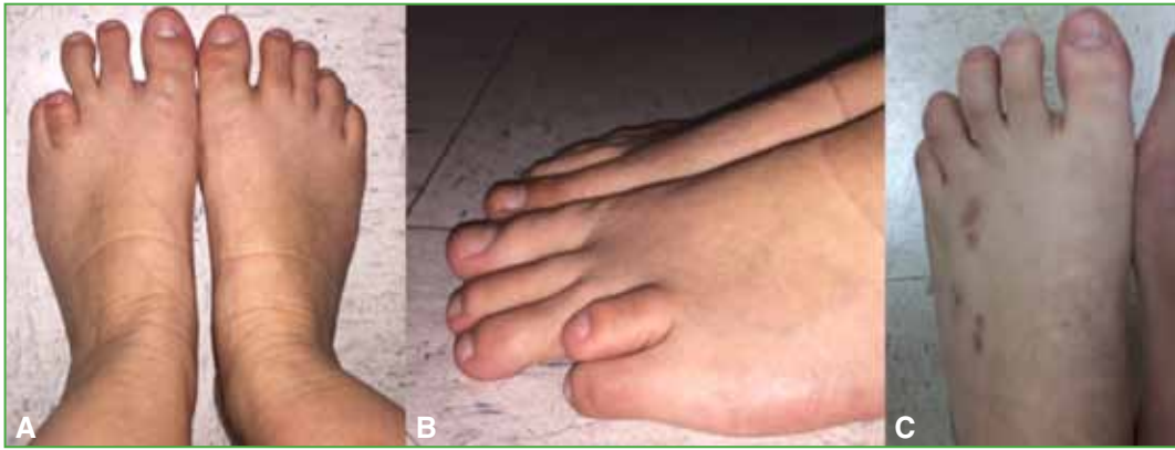
Figure 6. A. Left-foot brachymetatarsia. B. Postoperative result.