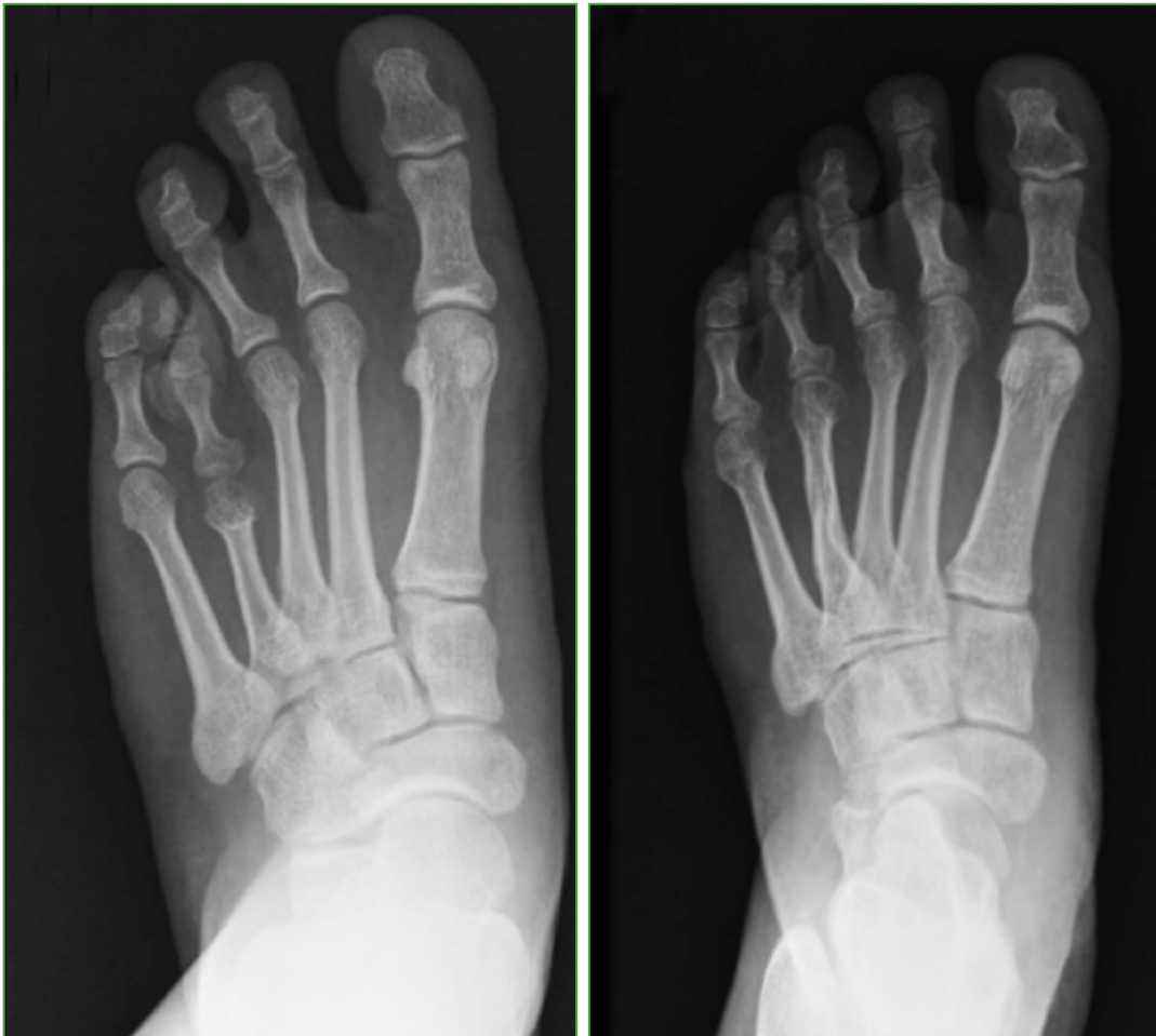
Figure 4. AP X-rays of the foot (weight-bearing) before and after the lengthening procedure with mini-fixator.

All patients were satisfied with the final result and referred that they would repeat and recommend surgery.