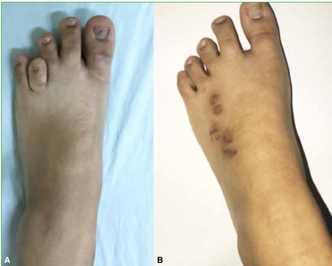
Figure 7. A. Left-foot brachymetatarsia. B. Postoperative result.