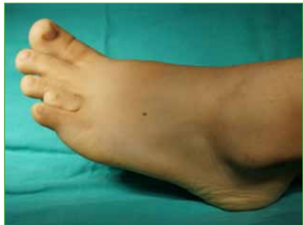
Figure 2. Preoperative image.