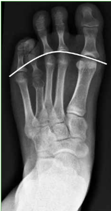
Figure 1. AP X-ray of the foot (weight-bearing). An arch created by metatarsal heads can be observed.

This study aims to show the results of the treatment that we employ in our Center (bone lengthening with the Pennig® external mini-fixator [Orthofix, Texas, USA]), describe the surgical approach and discuss the complications derived from it.