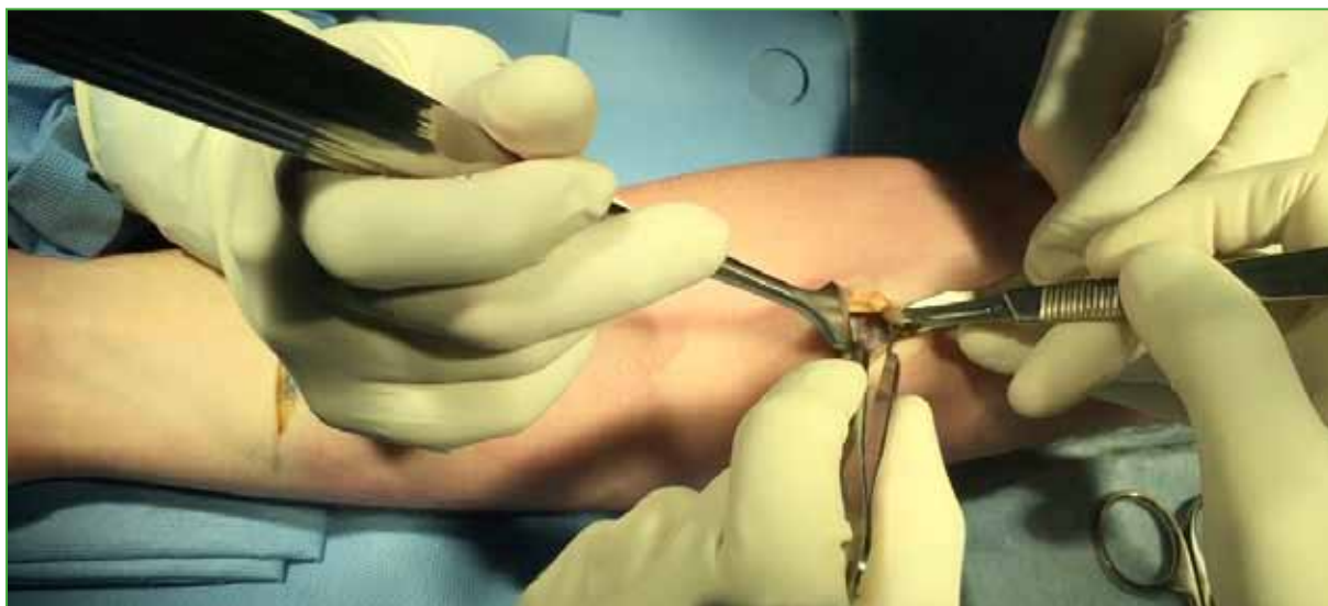
Figure 3. Proximal superficial fasciotomy.

A proximal (Figure 3) and a distal fasciotomy (Figure 4) are performed, and then a subfascial blunt dissection is performed to the distal incision. Next, a fasciotomy is performed on the vertical axis of the forearm, from the proximal incision to the distal one. If poor muscle implantation of one of the flexor muscles is detected, the fasciotomy is continued from the small distal incision towards the carpal tunnel without the need to section the flexor retinaculum of the hand. Then, the flexor carpi ulnaris muscle is moved radially to identify the flexor digitorum profundus muscle, which is covered by the deep antebrachial fascia. Once identified, a vertical fasciotomy is performed for decompression of the deep volar compartment. The deep volar fascia is sectioned with a scalpel following the vertical axis of the flexor digitorum profundus muscle. This VIDEO ► shows the subcutaneous and subfascial dissection approach for superficial volar fasciotomy.