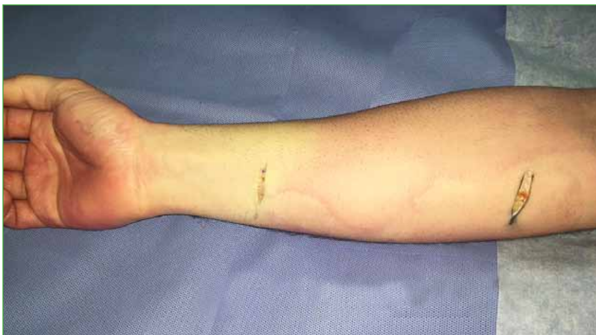
Figure 1. Transverse incisions, proximal and distal, in the anterior surface of the forearm.

On an imaginary line joining the epitrochlea and the midline of the palm of the hand, two small transverse incisions are made, one in the proximal third and the other in the distal third of the flexor compartment of the forearm ( Figure 1 ). Next, the antebrachial fascia of the volar surface is identified, after which a subcutaneous blunt dissection is performed by joining both incisions to separate the fascia from the subcutaneous tissue ( Figure 2 ).