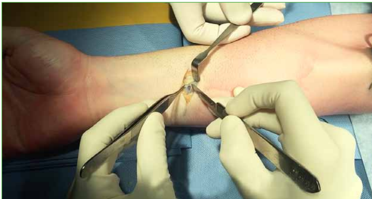
Figure 4. Distal superficial fasciotomy.