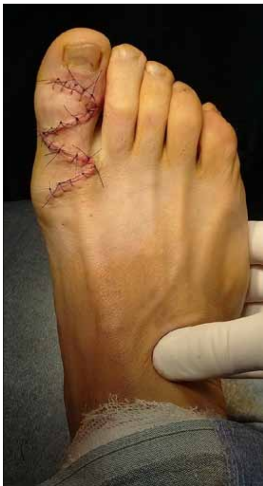
▲ Figure 6. Surgical technique. Closure of the wound. Interphalangeal joint in extension.

A brief bibliographic revision involving the treatment of lacerations affecting the extensor hallucis longus shows that treatment at acute stages is conservative, 4,5 but end-to-end tenorrhaphy is also suggested.