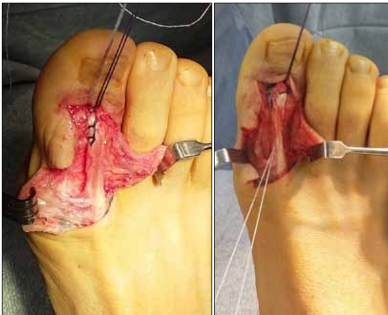
▲ Figure 4. Surgical technique. Anchorage of the tendón at distal level with harpoon plus proximal reinforcement.