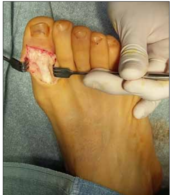
▲ Figure 3. Surgical technique. Dorsal approach. Scar fibrous tissue.

The rupture of the extensor hallucis longus is infrequent. The optimal treatment for the closed sudden rupture of this tendon is still controversial due to its low incidence.