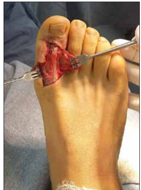
▲ Figure 5. Surgical technique. Reinserted tendon.