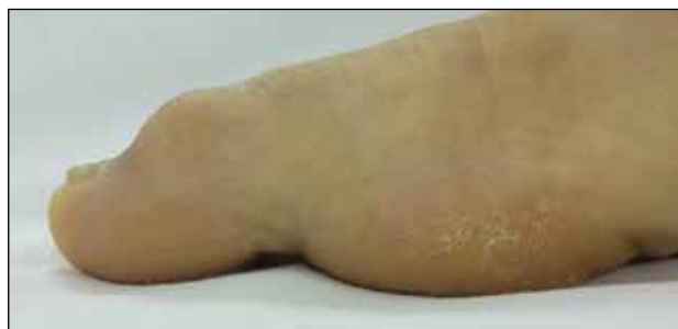
▲ Figure 1. Clinic image of hallux in interphalangeal joint-plantar flexion.

MRI shows rupture of the extensor hallucis longus at the level of its insertion (Figures 2C and D).