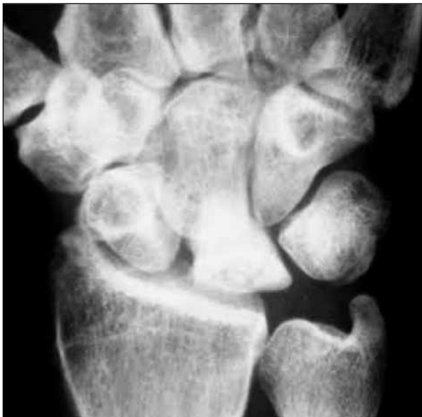
▲ Figure 2. 45-year-old patient with stage IIIA-Kienböck's disease. Preoperative AP X-ray.

Like Sherman et al., we believe that the beneficial effects of metaphyseal core decompression in the distal radius does not come from the discharge of overpressure on the lunate aspect of the radius (mechanical effect), but from some unknown biological reaction of vascular kind which is generated by the procedure at regional level. 17 Thus, our hypothesis is that, as it is the case in other bone procedures nearby the lunate bone, radial decompression generates a regional vascular stimulus at carpal-bone level. Radial osteotomy may generate—as it has been verified in radial fractures—a cascade release of angiogenesis and osteogenesis factors at regional level which might underlie the effects on the lunate bone caused by radial surgery. 18