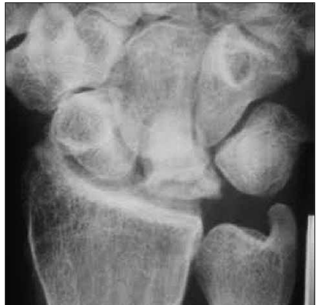
▲ Figure 3. AP X-ray 12 years after metaphyseal core decompression of distal radius.