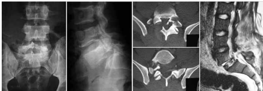
▲ Figure 1. L5-S1 traumatic spondylolisthesis. In imaging studies there is L5 displacement upon the sacral bone associated with rotation of the cephalic vertebral bones, facet dislocation as well as an injury in the posterior ligament complex and the L5-S1 disc.

Facet dislocation or fracture-dislocation is a frequent condition in the cervical spine. However, at lumbosacral level, the presence of the ilio-lumbar ligaments and the orientation of the joint aspects give the spine considerable intrinsic stability; therefore, for an injury at this level to occur more than one prevailing force have to concur.