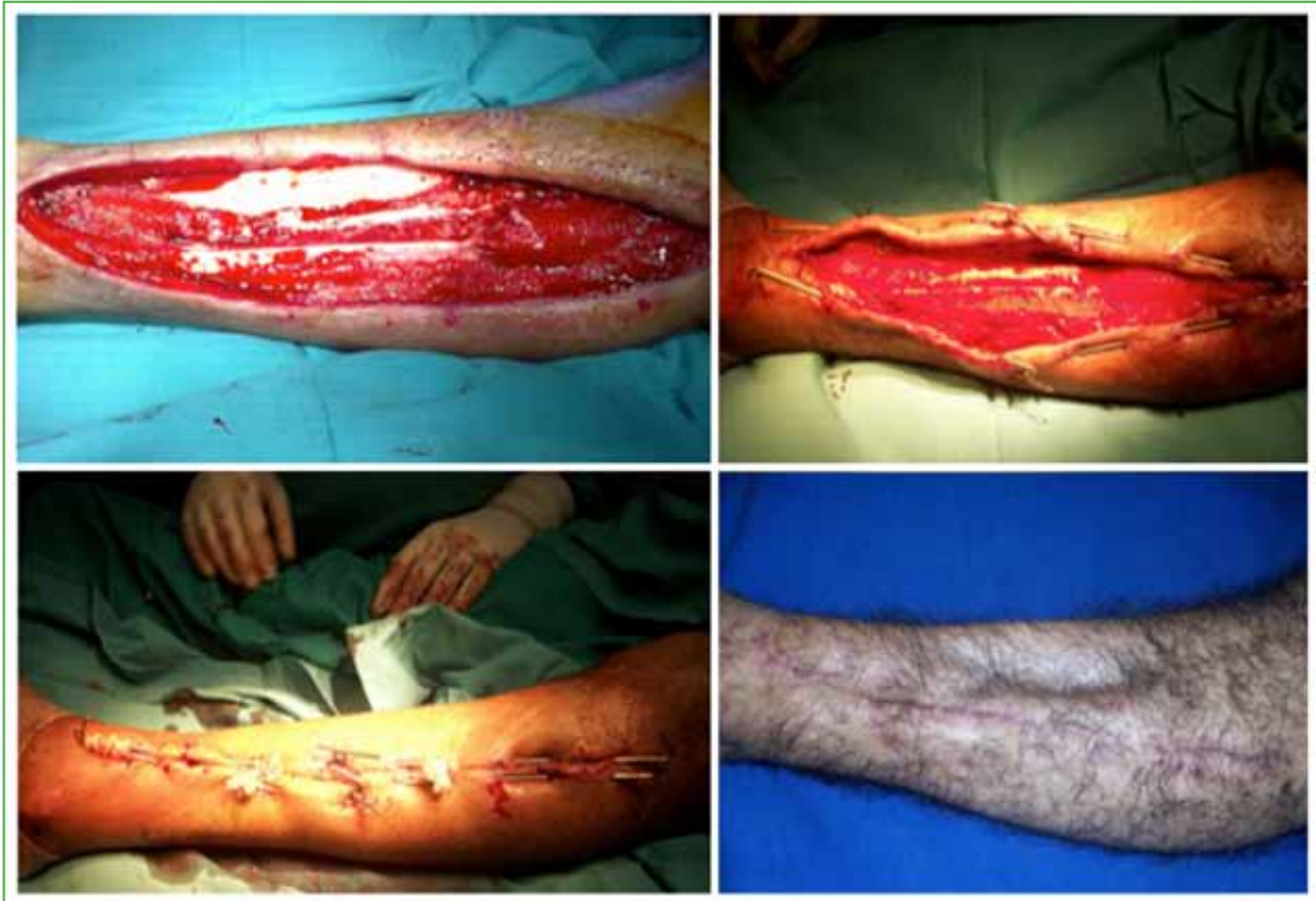
Figure 2. 18-year-old male, with traumatic posterior dislocation of the knee with vascular compromise and subsequent compartment syndrome. A femoral-tibial bypass with contralateral reversed internal saphenous vein and decompressive fasciotomy were performed. After healing of an infection, closure with pins was performed.