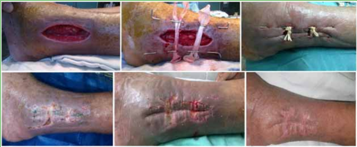
Figure 4. 35-year-old man with an operated ankle fracture. The wound presents dehiscence with exposure of the surgical material. The material is removed, the wound is treated with a vacuum aspiration system and closed with two pins.