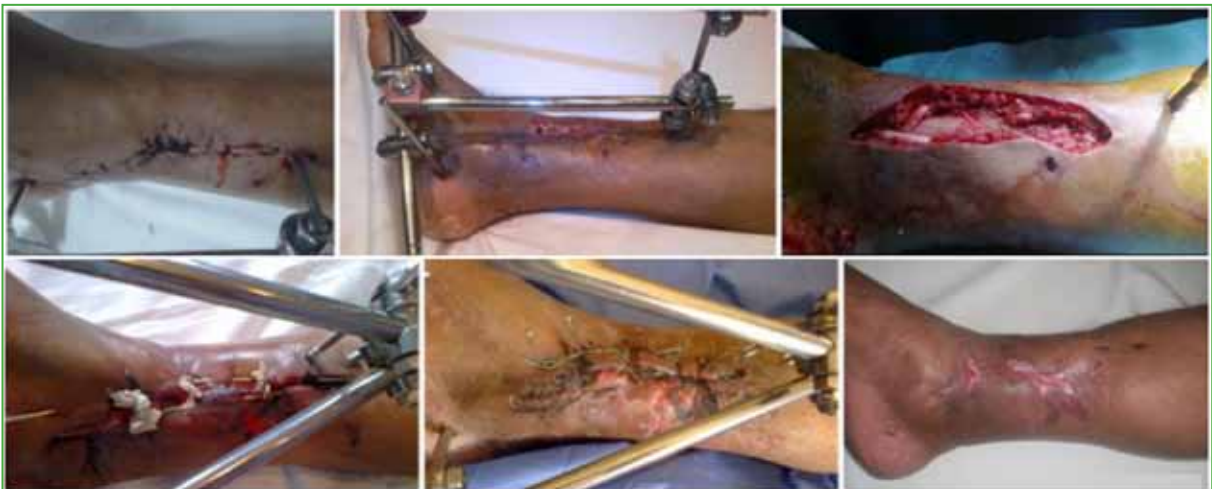
Figure 3. 22-year-old male with an open tibial plafond fracture and an ongoing infection in the open wound. A mechanical-surgical cleaning was performed and treated with a vacuum aspiration system. The external fixator was repositioned and the wound was closed with this pin method.