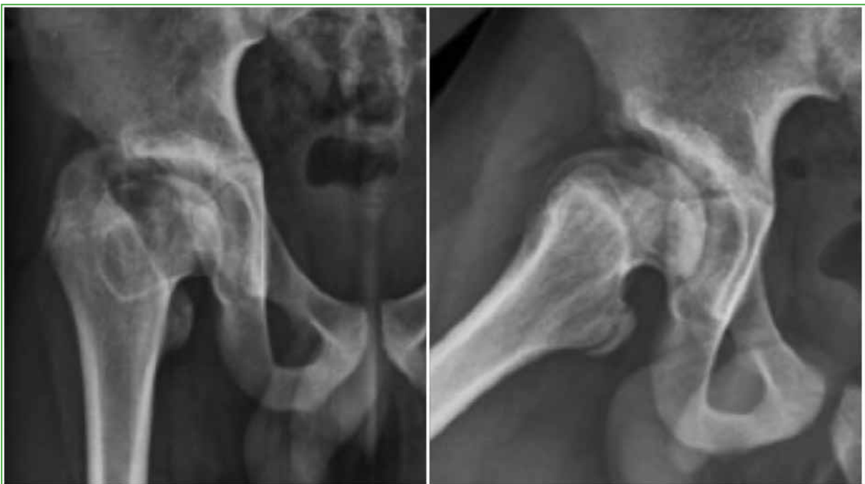
Figure 1. Anteroposterior and axial radiographs of the hip showing residual deformities of Legg-Calvé-Perthes disease.

Likewise, a literature search was carried out in databases such as PubMed, Medline, Cochrane, Clinical Key, with keywords such as “total hip arthroplasty”, “Perthes disease” and “secondary hip osteoarthritis”.