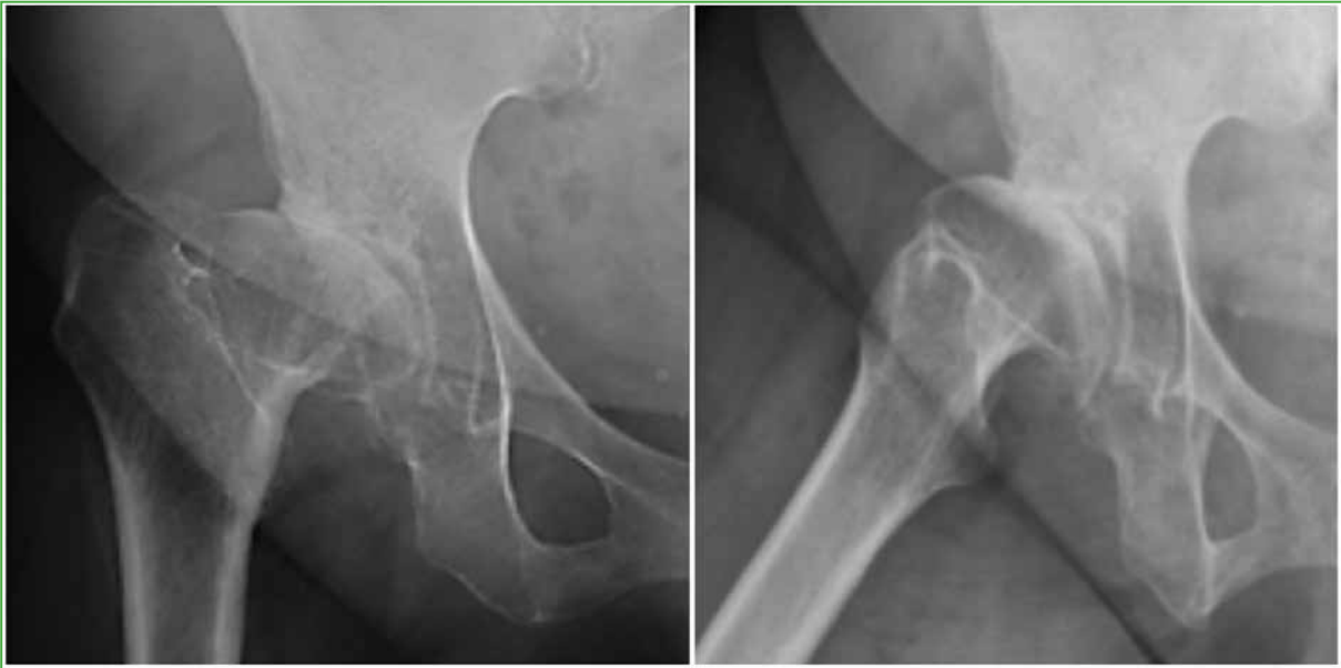
Figure 2. Anteroposterior and axial radiographs of the hip showing hip osteoarthritis secondary to Legg-Calvé-Perthes disease.