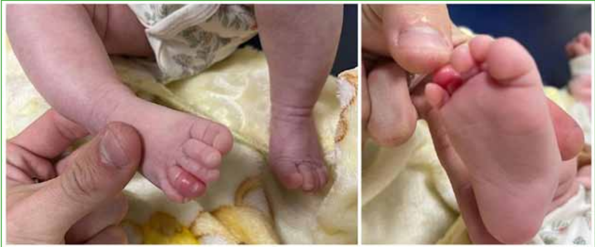
Figure 1. Clinical images at admission.

The patient is a 3-month-old patient, born at 33 weeks gestation, with neonatal anemia, on supplemental iron treatment and neurorehabilitation. The family consulted the emergency department of our institution because the girl had persistent edema of the fourth toe of the right foot, without being able to specify the time of evolution. Physical examination revealed congestive edema of the fourth toe, erythema, and pain to the touch and passive mobilization (Figure 1).