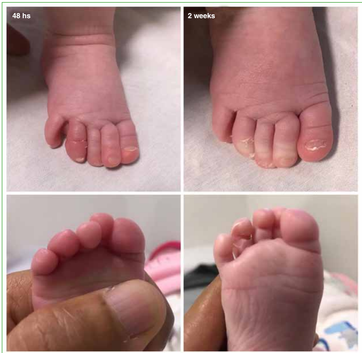
Figure 3. Clinical images during follow-up.

After hair removal, distal perfusion improved and edema decreased within a few minutes (Figure 3). The patient was monitored the next day in the outpatient clinic of the Children’s Orthopaedics and Traumatology Service and a good evolution of the condition was confirmed. At the last follow-up at 10 days, the distal circulation of the finger had completely recovered, she had no edema, and she was discharged.