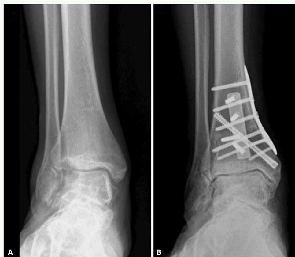
Figure 2. Takakura Stage IIIA. A. Preoperative ankle radiograph, AP view. B. Anteroposterior ankle radiograph, 6 years after internal supramalleolar closing-wedge varus osteotomy.

SD = standard deviation; IQR = interquartile range.