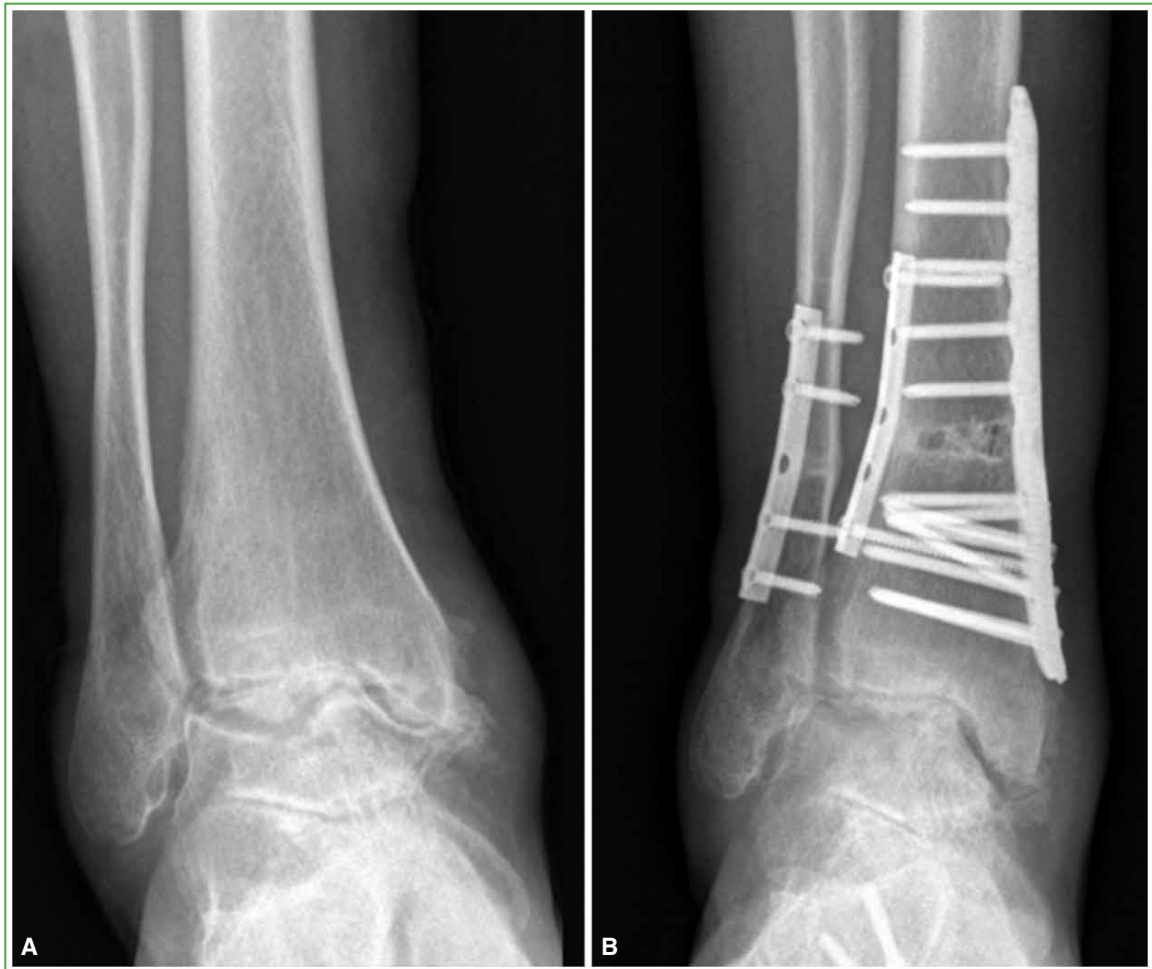
Figure 3. Takakura Stage IIIB. A. Preoperative ankle radiograph, AP view. B. Anteroposterior ankle radiograph, 2 years after internal supramalleolar opening-wedge valgus osteotomy.