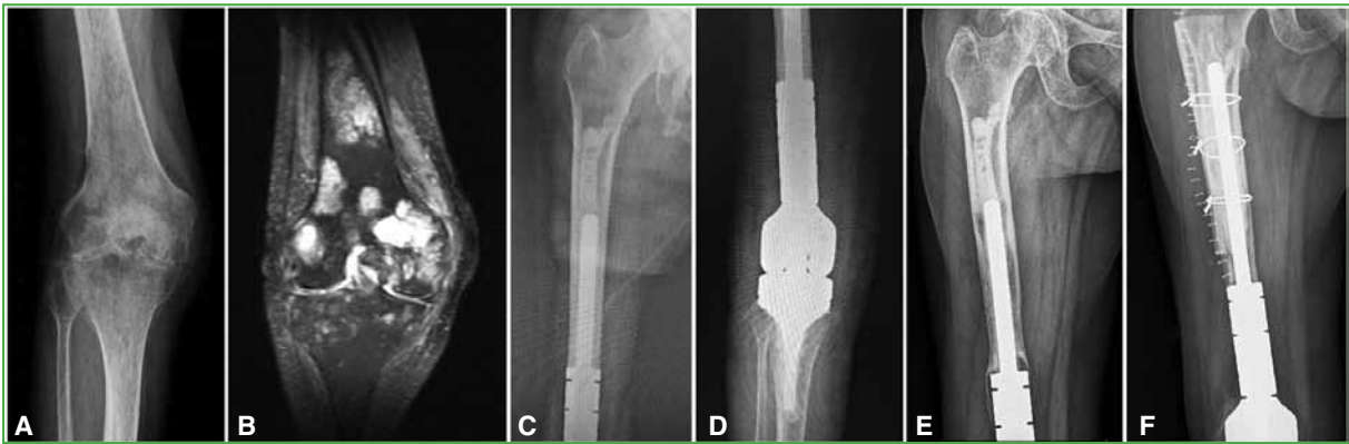
Figure 1. Revision for aseptic loosening in a patient with distal femoral bone lymphoma. A and B. Initial anteroposterior right knee radiograph and right knee MRI. C and D. Postoperative anteroposterior radiographs of the right femur and knee. E. Anteroposterior radiograph of the right femur 13 months after surgery. Signs of aseptic endoprosthesis loosening can be observed. F. Anteroposterior radiograph of the right femur after the revision.