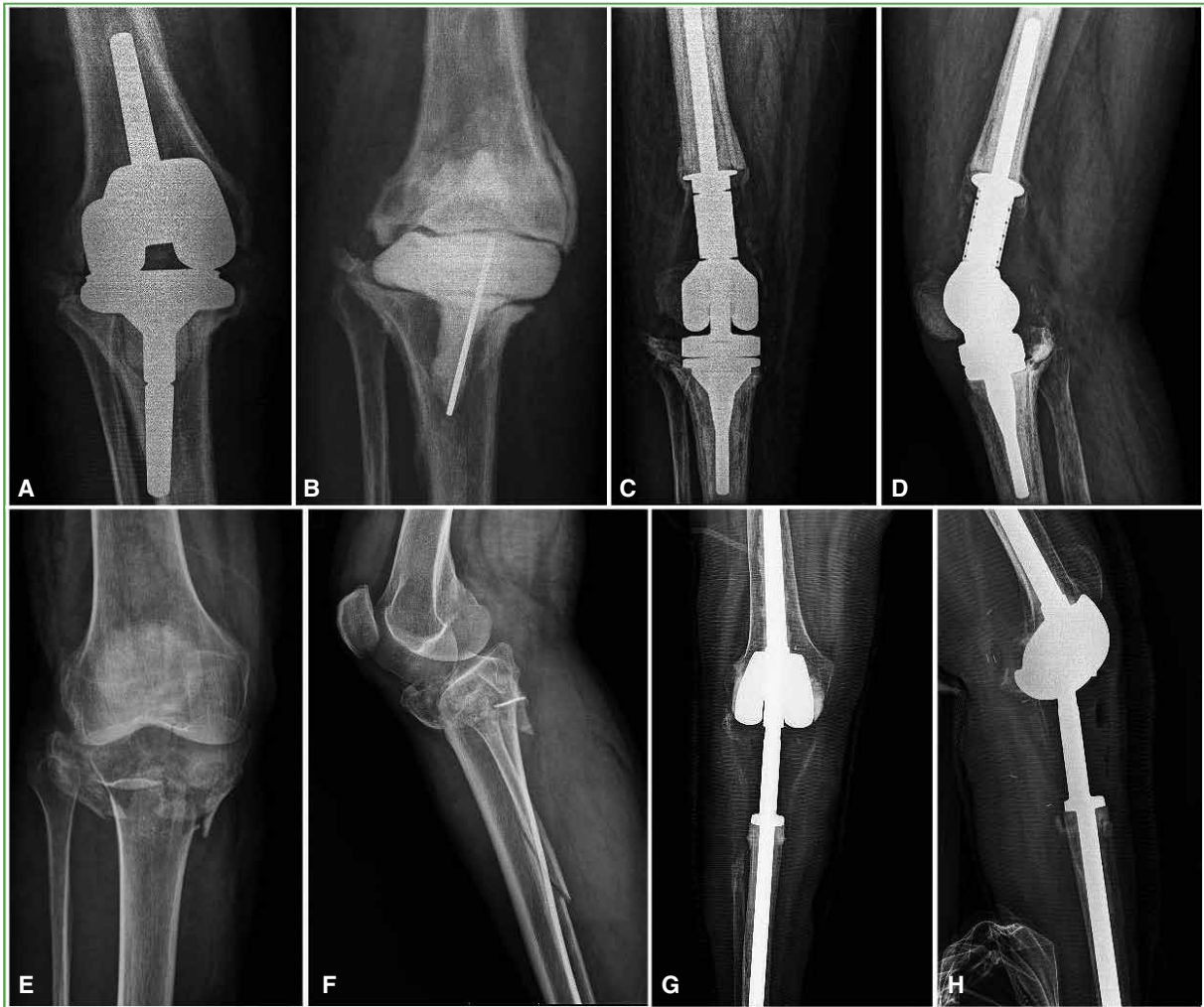
Figure 5. Examples of knee reconstruction with non-conventional prosthesis. A-D. Distal femur. E-H. Proximal tibia.

conditions exhibit characteristics that are distinct and different from those of oncologic patients. General condition and comorbidities, soft tissue status, lesion characteristics, previous surgeries, presence of adhesions, and previous infections are factors that should be carefully considered when using the endoprosthesis in these cases. These factors are very important in determining whether or not the prosthesis will fail. 5