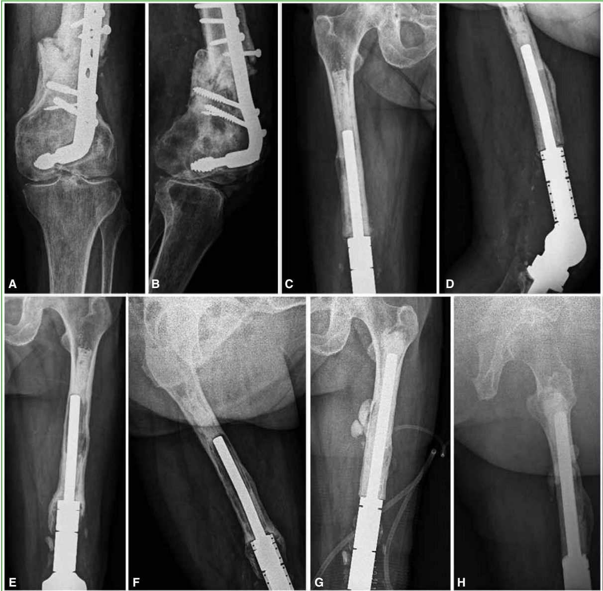
Figure 4. Distal femur nonunion and subsequent aseptic loosening. The patient's evolution is observed. A and B. Initial anteroposterior and lateral radiographs of the left knee. Nonunion of a distal femur fracture. C and D. Anteroposterior and lateral radiographs of the left femur in the immediate postoperative period. E and F. Anteroposterior and lateral radiographs of the left femur showing signs of aseptic loosening of the endoprosthesis. G and H. Anteroposterior and lateral radiographs of the left femur after the revision.

It has been shown that the implant survival rate of endoprostheses does not differ significantly between individuals with post-neoplastic disease and those with non-neoplastic conditions. 14