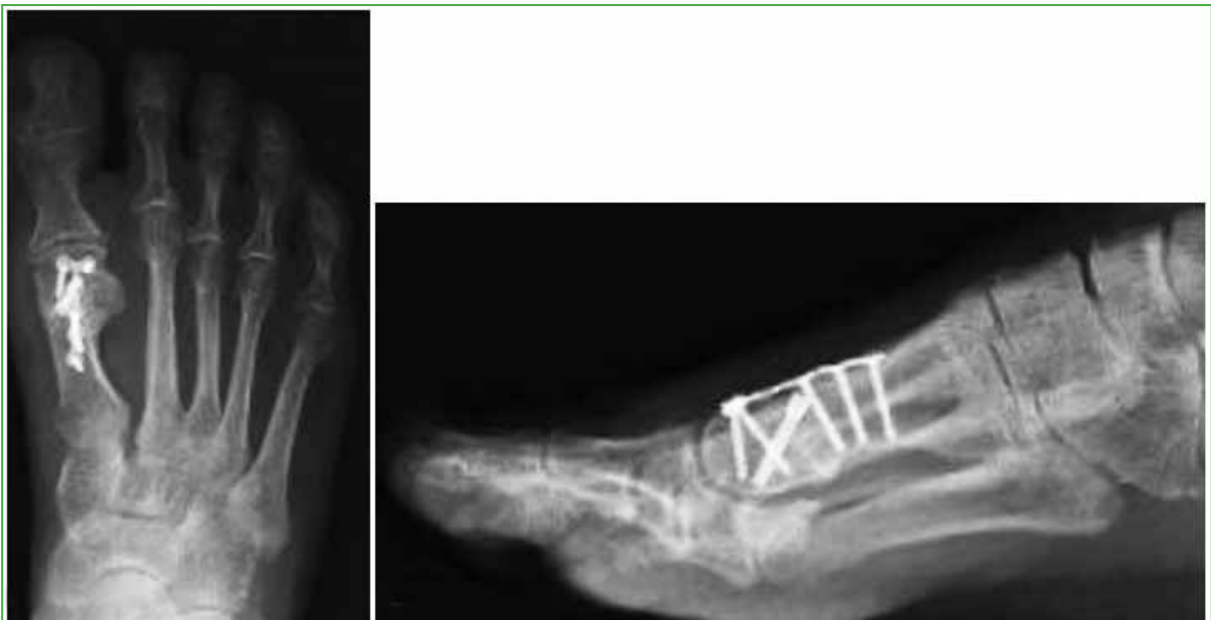
Figure 5. Radiographic control 2 months after surgery. Consolidation of the nonunion focus is visualized.