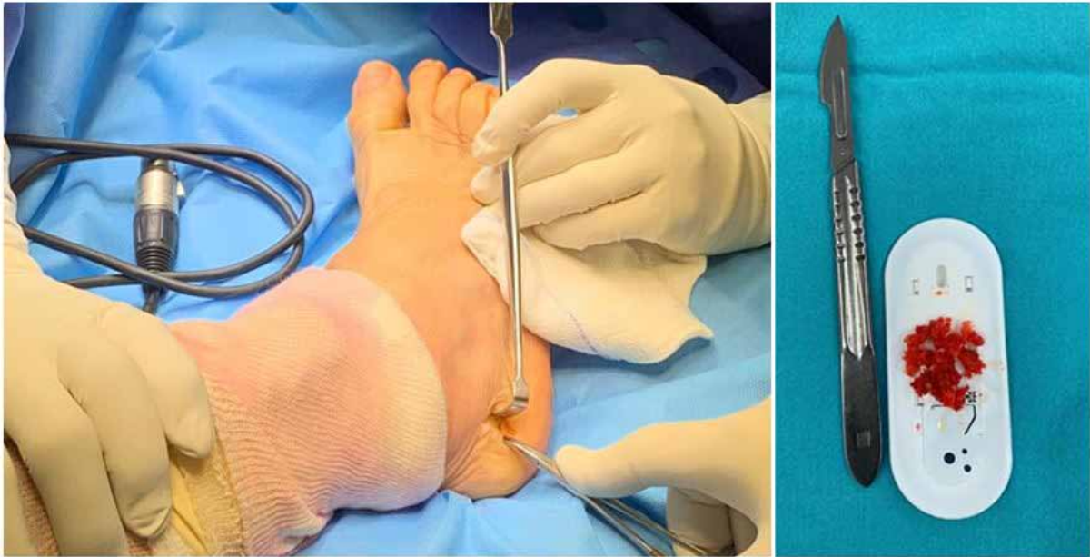
Figure 6. Lateral incision on the calcaneus to harvest the autologous bone graft.

The patient is placed in dorsal decubitus position on the general surgery table. Antibiotic prophylaxis is administered at anesthetic induction, after decontamination with 2% chlorhexidine gluconate mixed with 70% isopropyl alcohol. Double fields are placed according to technique and an Esmarch bandage is applied to the ankle. A lateral incision is made over the calcaneus to harvest the autologous bone graft (Figure 6).