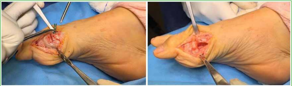
Figure 8. Removal of osteosynthesis material and subsequent bone curettage.

The osteosynthesis material is removed and bone curettage is performed (Figure 8).