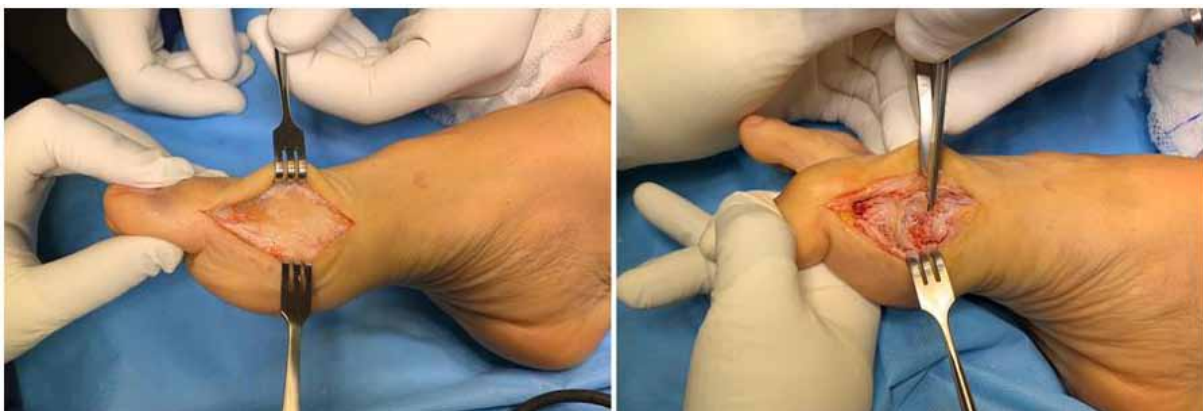
Figure 7. Medial longitudinal approach to the hallux over the previous incision, capsulotomy, and identification of the nonunion focus.

A medial longitudinal approach to the hallux is made over the anterior incision, the capsulotomy is carried out, and the focus of nonunion is identified (Figure 7).