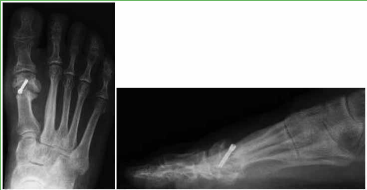
Figure 2. Anteroposterior and lateral radiographs of the foot, three months after the operation. A nonunion focus is observed at the level of the chevron osteotomy.

Thus, the series was made up of five patients (4 female and 1 male) who had imaging studies compatible with pseudarthrosis six months after the operation (Figures 2 and 3). The AOFAS ( American Orthopaedic Foot and Ankle Society ) score was used before and after both procedures (initial hallux valgus surgery and nonunion surgery).