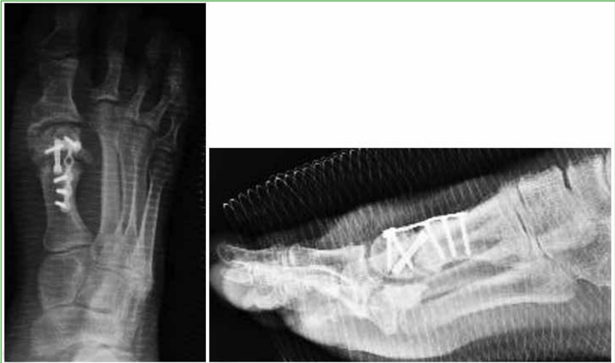
Figure 4. Anteroposterior and lateral foot radiographs in the immediate postoperative period. Plate and screw osteosynthesis is shown for the treatment of nonunion.

All patients were treated with surgery (Figures 4 and 5). Follow-up for this treatment was >24 months.