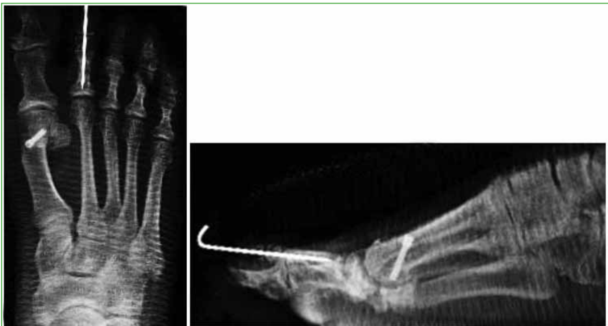
Figure 1. Anteroposterior and lateral foot radiographs in the immediate postoperative period. Chevron osteotomy, Akin osteotomy, and distal interphalangeal arthrodesis of the second toe.

A retrospective, multicenter study was conducted that included patients who underwent chevron and Akin osteotomy (Figure 1) for the treatment of mild or moderate hallux valgus, between 2009 and 2018. A total of 1156 chevron osteotomies were evaluated in 1017 patients (355 bilateral). 95% were women and 5% men, the age ranged from 16 to 83 years (average 57.5). The procedure was carried out by four experienced surgeons. Johnson's modified V-shaped osteotomy was performed. The osteotomy was stabilized with a 3.0 mm screw directed from proximal to distal and from medial to lateral. Radiographs of all patients were taken in the immediate postoperative period, at one month, and at three and six months. Patients with radiographic signs of osteotomy consolidation were discharged six months after surgery.