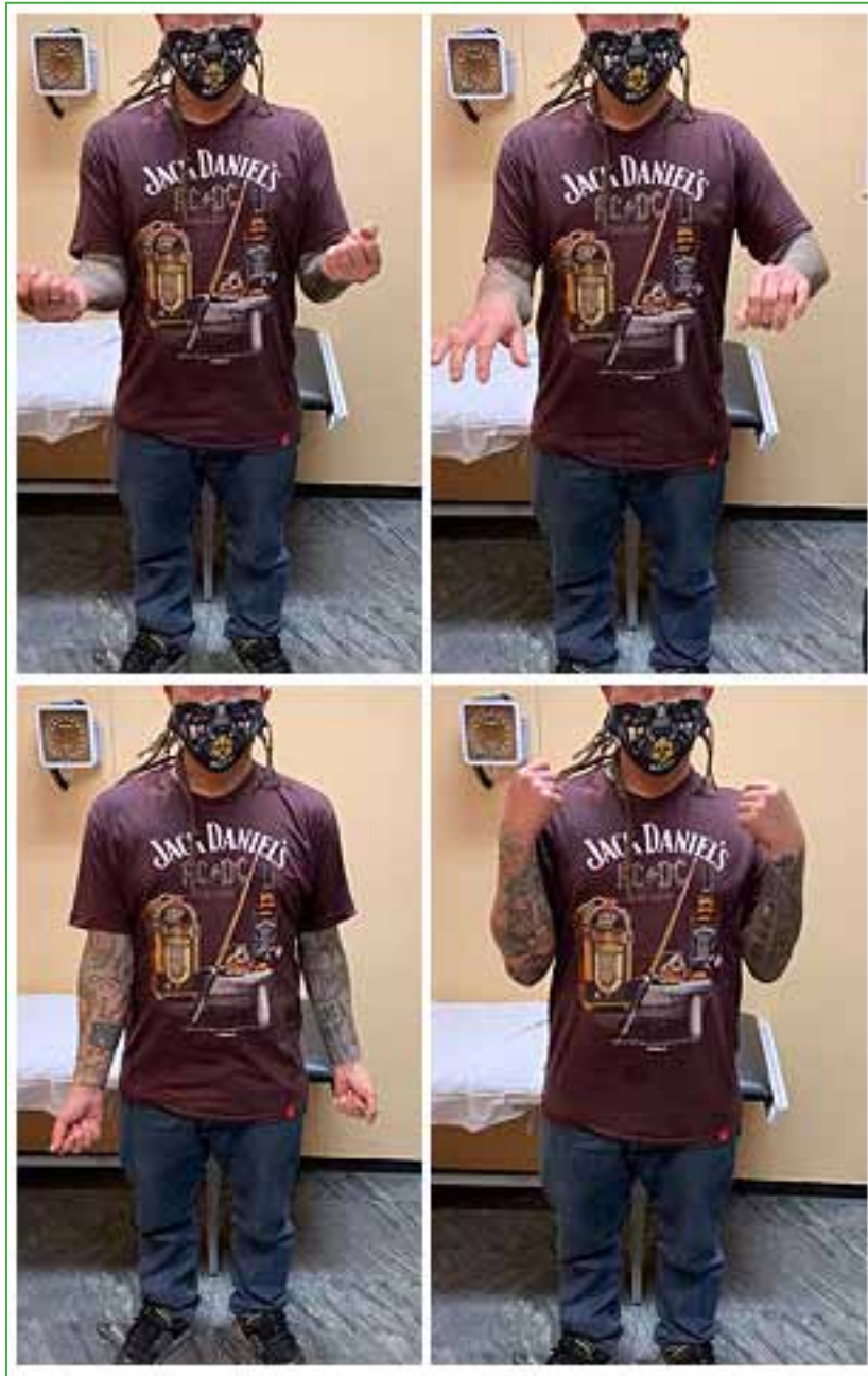
Figure 3. Postoperative range of motion - 6 weeks.

Bone consolidation was confirmed in all patients, except for one who developed elbow joint stiffness due to poor follow-up with delayed consolidation (16.6%). He continued with occupational therapy and achieved bone consolidation and recovery of the range of motion. There were no wound complications nor revision surgeries. The average flexion was 143° (range 160°-90°) and the average extension was 19° (range 0°-55°). All reached full pronosupination (Figure 3 and Table).