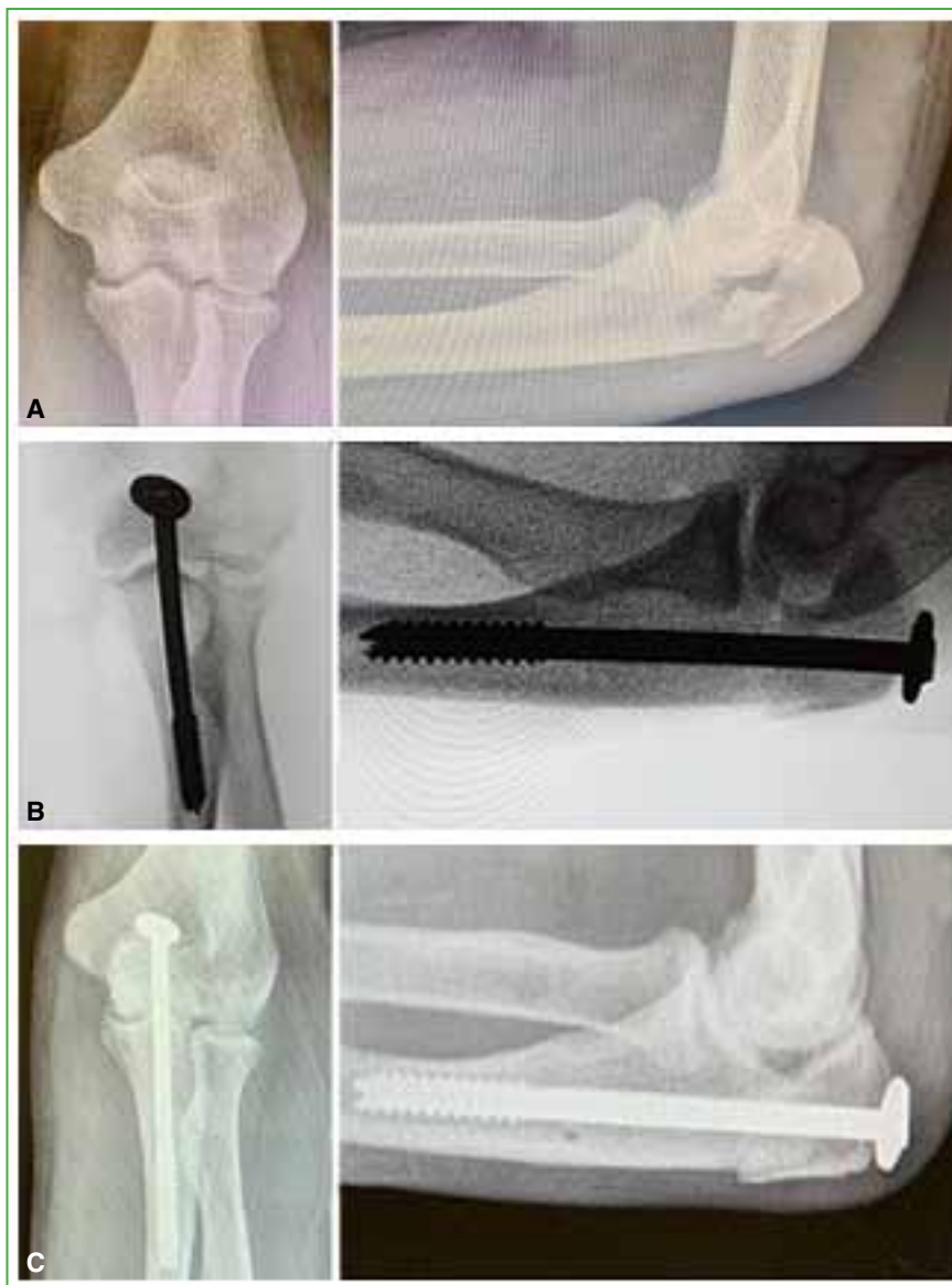
Figure 2. A. Anteroposterior and lateral radiographs of a fracture. B. Immediate postoperative period. C. Consolidated fracture at week 10.

Six patients with simple displaced type IIA fracture of the olecranon were identified and were treated with high-strength sutures and an intramedullary partial-thread cannulated screw with a 6.5 mm washer. Four patients were men and two were women, and the average age was 43 years (range 24-60). Immediate postoperative radiographic controls were performed, and at weeks 2, 6 and 10 (Figure 2).