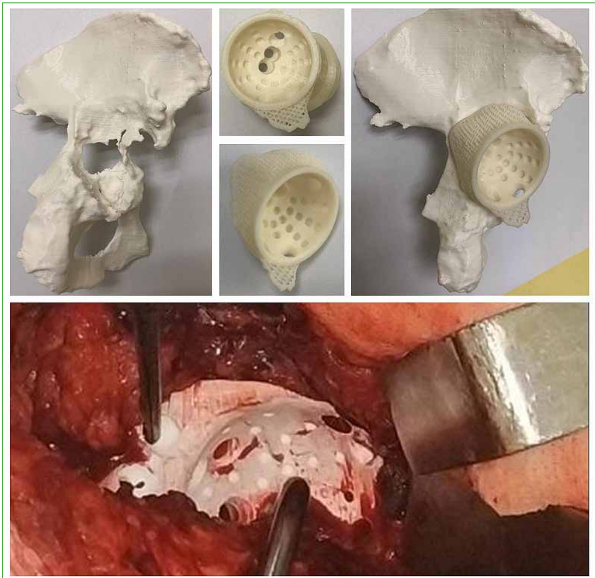
Figure 3. Example of a mold for preoperative planning and the mold used in Case 1 surgery.

During surgery, the surgeon is provided with a trial anatomical mold, the 3D monitors allow locating the defect, the position of the custom component, the screws to be placed, the length and the direction (Figure 3).