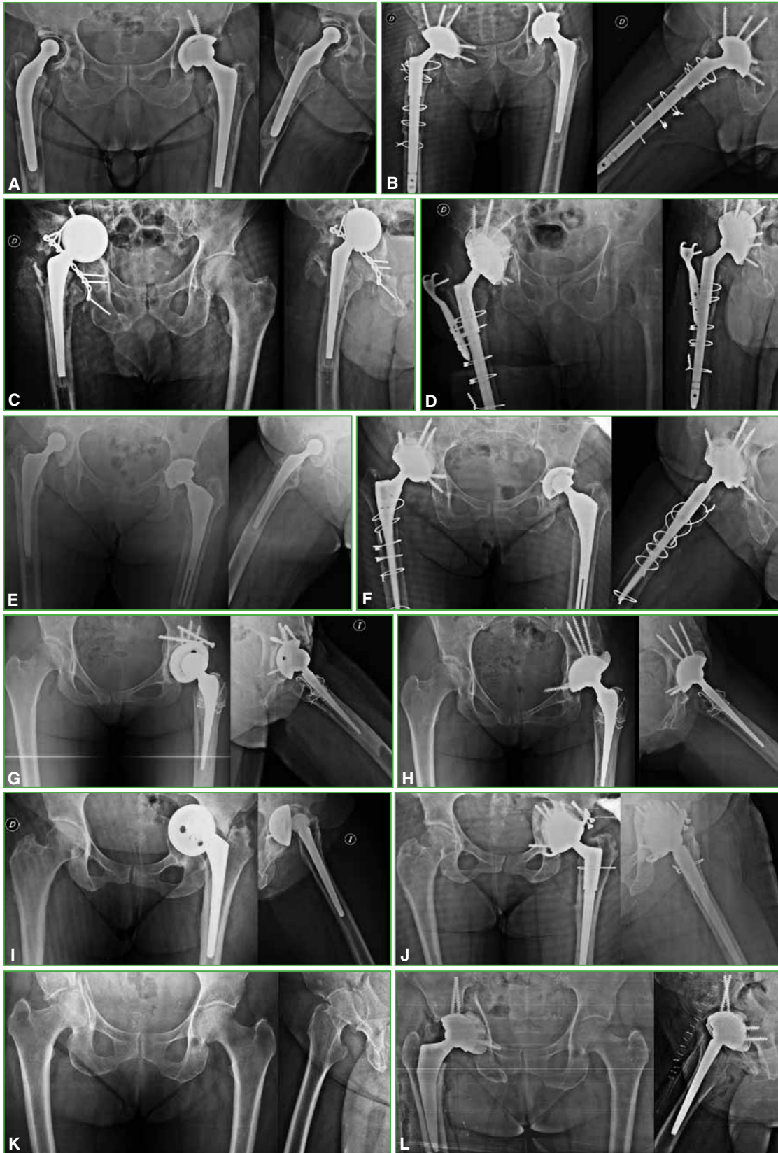
Figure 1. Preoperative anteroposterior and lateral hip radiographs of the treated cases. A and B. Case 1. C and D. Case 2. E and F. Case 3. G and H. Case 4. I and J. Case 5. K and L. Case 7. The description of each patient is detailed in Table 1 .