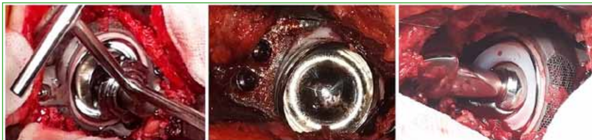
Figure 5. Intraoperative image of the cementation of the dual mobility cup within the three-dimensional implant. This makes it possible to reduce the overload on the latter and reduce the risk of dislocation, one of the most frequent complications when using the 3D cup.