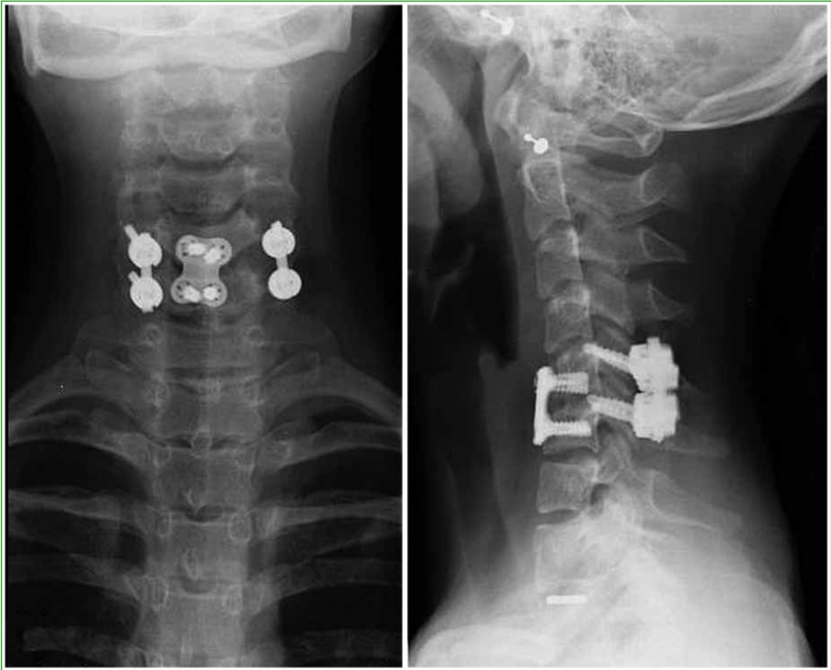
Figure 4. Anteroposterior and lateral radiograph of the cervical spine. Immediate postoperative control of the anterior and posterior arthrodesis of C5-C6.