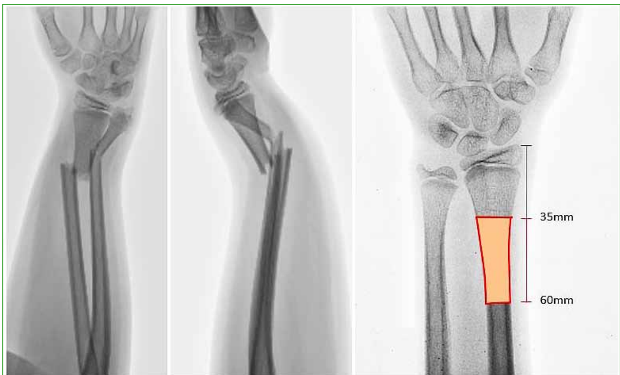
Figure 1. Definition of metaphyseal-diaphyseal fracture of the radius: those with a distance from the articular surface to the fracture of between 35 and 60 mm.

A comparative study was carried out and approved by the Ethics Committee of our institution. We included 36 patients between 10 and 16 years of age with closed metaphyseal-diaphyseal fractures of the distal radius who underwent closed reduction and PP (group A, n = 17) or ESIN (group B, n = 19) in six years (2012-2018). Metaphyseal-diaphyseal fractures were defined as those with a distance from the fracture to the joint surface of between 35 and 60 mm (Figure 1). 10