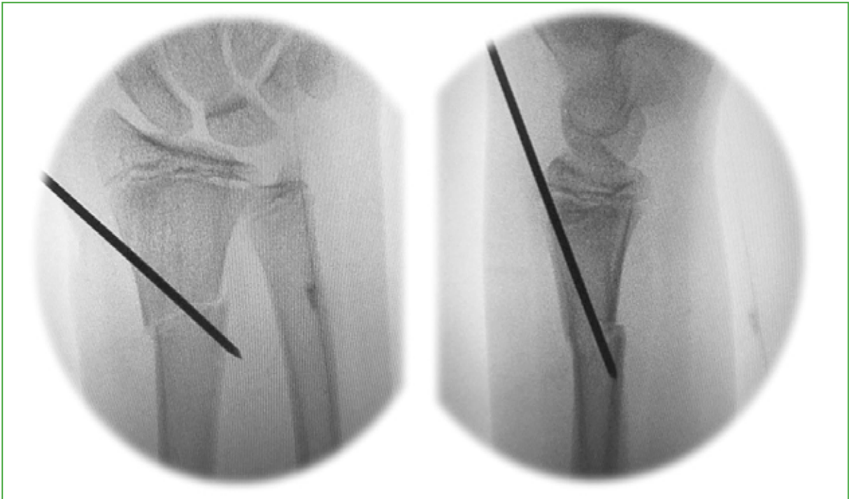
Figure 2. Percutaneous pinning technique. After reduction, a 1.8mm pin is placed and entered proximal to the distal radius physis, fixing the distal and proximal fragment. Intraoperative stability is then checked by fluoroscopy.

The procedure is performed under general anesthesia and intraoperative monitoring. The patient is placed in the dorsal decubitus position with the arm abducted on the hand table. Asepsis and antisepsis are performed, and the fields are placed according to the technique. The C-arm enters distally and is placed parallel to the patient, and the monitor faces the surgeon. Reduction is performed according to technique and stability is checked. If a satisfactory reduction is not achieved under fluoroscopy or it is considered very unstable, fixation is carried out. In patients undergoing PP, a 1.8mm pin is placed, entering below the radial physis from distal to proximal (Figure 2).