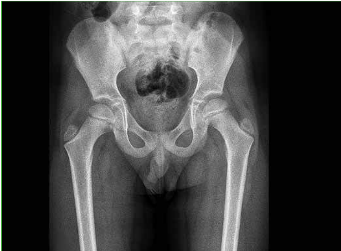
Figure 3. Anteroposterior radiograph of the hip at 6 months of evolution. There are no signs of bone compromise.