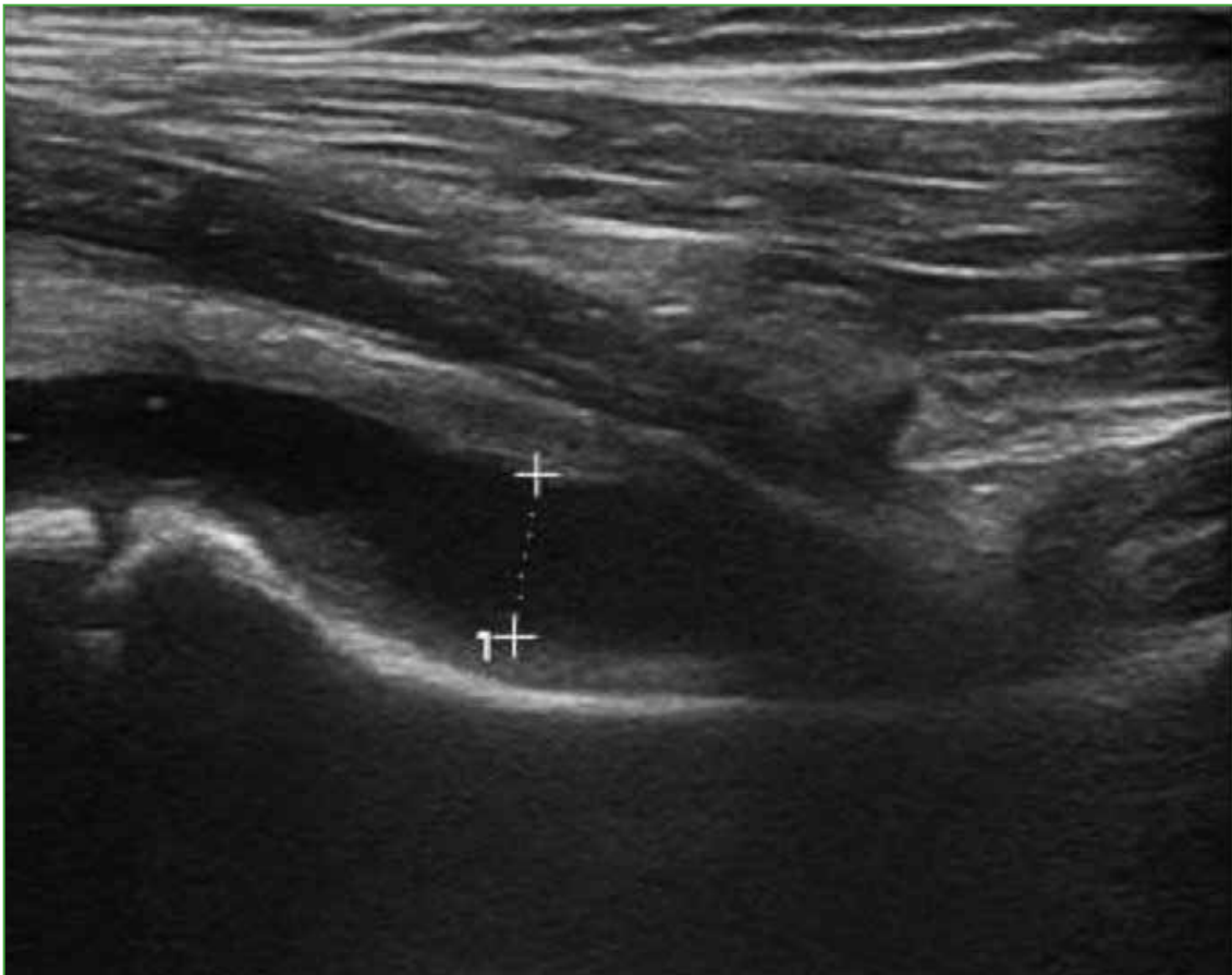
Figure 1. Hip ultrasound showing a right joint effusion with a detachment of 7 mm from the joint capsule, with intact muscle planes.

Imaging studies were ordered, including radiographs and ultrasound of both hips. In the radiographic studies, no bone or soft tissue lesions were observed, with both joint spaces preserved. The ultrasound of the right hip showed a joint effusion with a detachment of 7 mm from the joint capsule (Figure 1). With these results and with the suspicion of transient synovitis, the patient began outpatient treatment with oral anti-inflammatory agents.