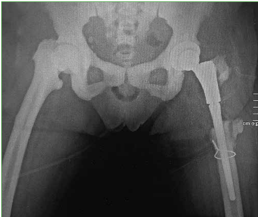
Figure 7. Postoperative control radiograph of open reduction of dislocation and reattachment of the hip abductor mechanism.