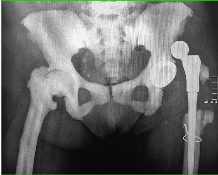
Figure 6. Posterior dislocation of total left hip prosthesis, with no history of falls.