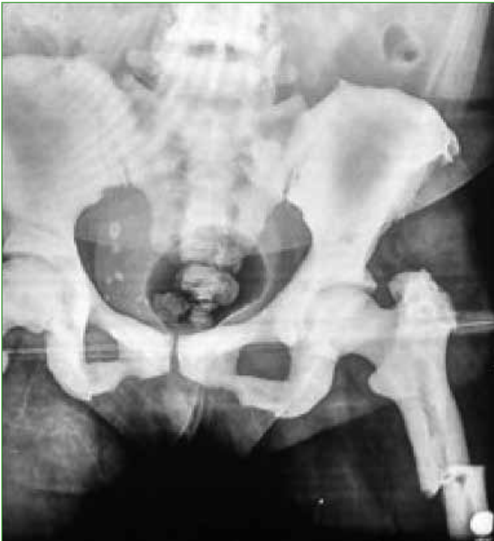
Figure 1. Subtrochanteric fracture of the left hip in pathological femur, with radiological findings suggestive of Paget disease (cotton wool appearance).

A 63-year-old woman residing in the city of Medellin, Colombia. She was an independent worker with a previous diagnosis of Paget disease with polyostotic presentation, diagnosed incidentally due to radiological findings and family history. In 2015, the patient suffered a fall from her own height and a subtrochanteric fracture of the left hip was verified, which was given surgical management at another institution. We consider that the fracture occurred in a previously pathological bone compromised by Paget disease (Figures 1 and 2).