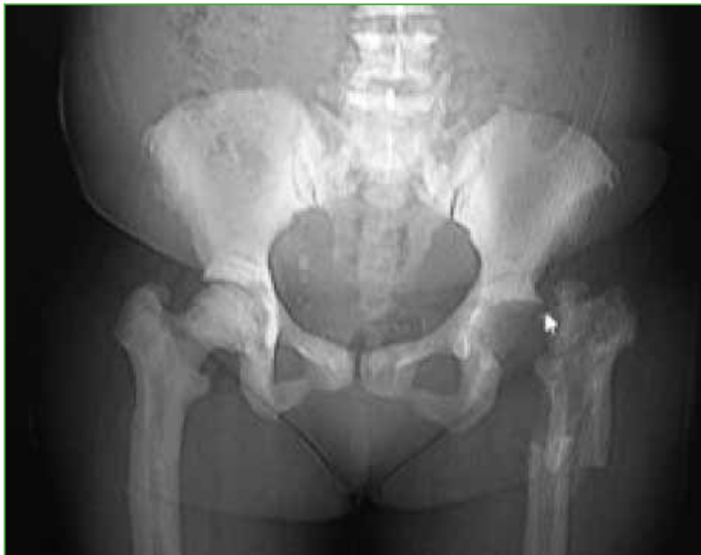
Figure 4. Postoperative control radiograph of removal of osteosynthesis material plus interposition arthroplasty with resection of the femoral head.