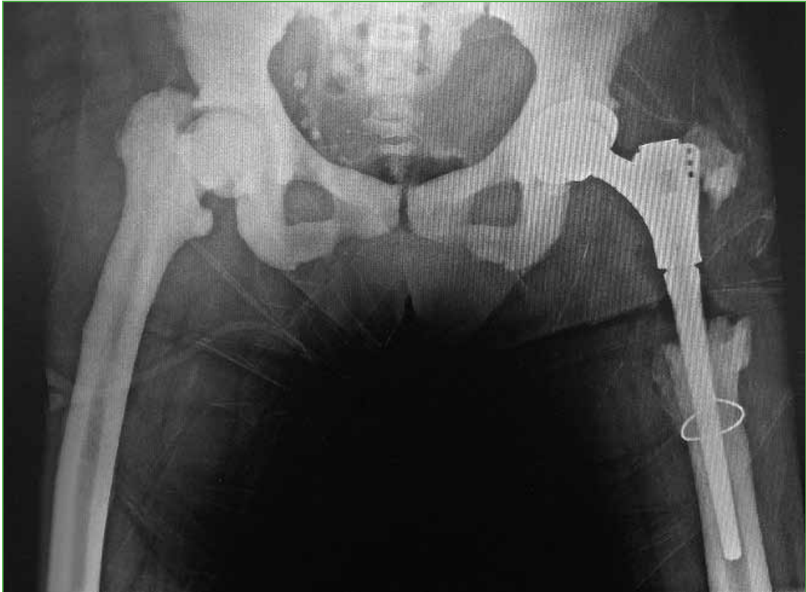
Figure 5. Postoperative control radiograph of total left hip prosthesis plus osteotomy and ostectomy of the proximal femur.

In February 2018, said intervention was performed together with a corrective osteotomy of the proximal femur and proximal ostectomy at the level of the trochanter through a posterolateral approach, without complications. A 44 x 28 uncemented acetabulum was implanted, together with 4 acetabular fixation screws, a 44 x 28 highly cross-linked polyethylene insert, a 140 mm x 13 mm uncemented revision stem with proximal metaphysis, with a wing for the fixation of the hip abductor mechanism and a 28M cobalt-chromium head (Figure 5).