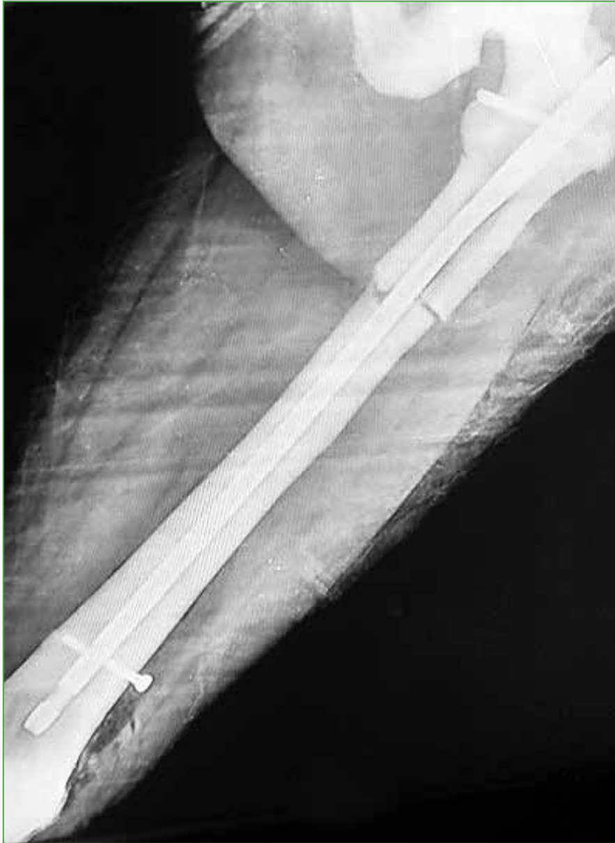
Figure 2. Postoperative control radiograph of osteosynthesis of the proximal femur with a long locking intramedullary nail.

During the postoperative evolution, due to the presence of pseudarthrosis (diagnosed 6 months after the operation and managed in another institution), the osteosynthesis material (locking intramedullary nail) was removed and the femoral head was resected, so a resection arthroplasty remained (Figures 3 and 4).