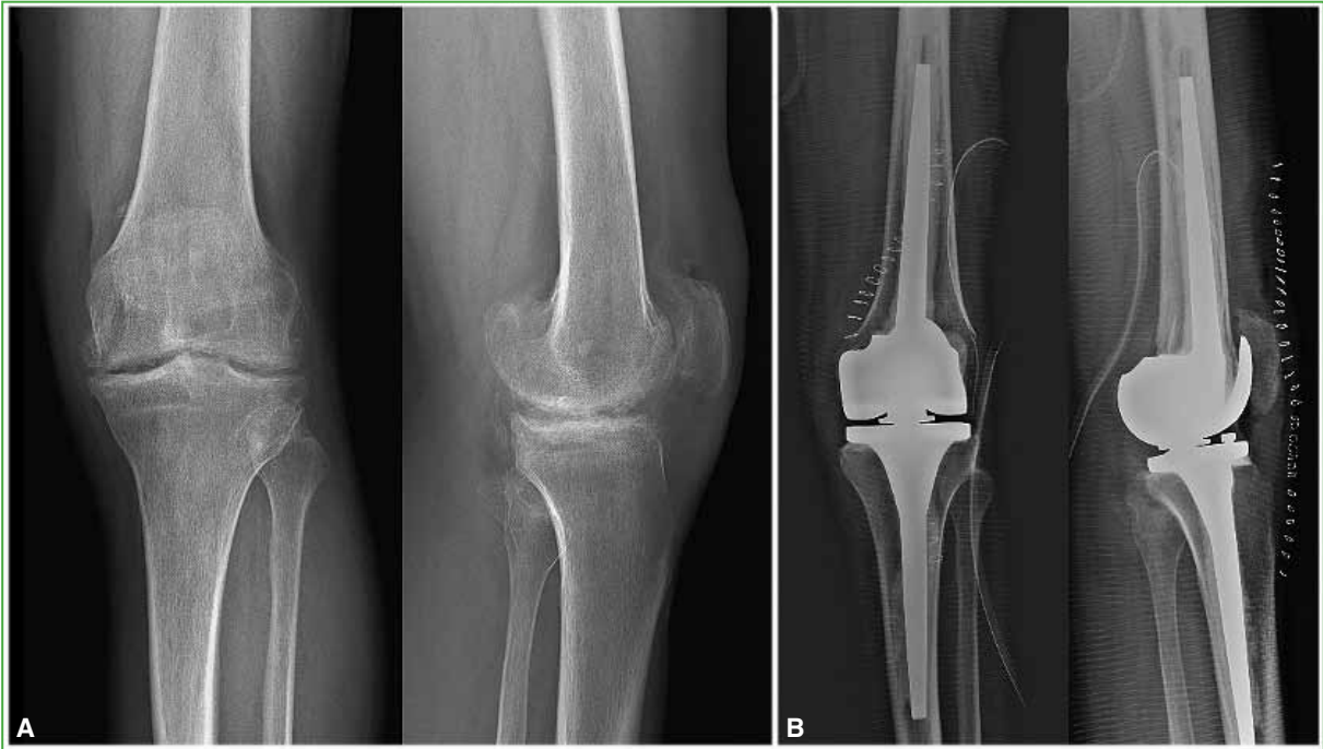
Figure 7. Preoperative (A) and postoperative (B) anteroposterior and lateral radiographs of the left knee.