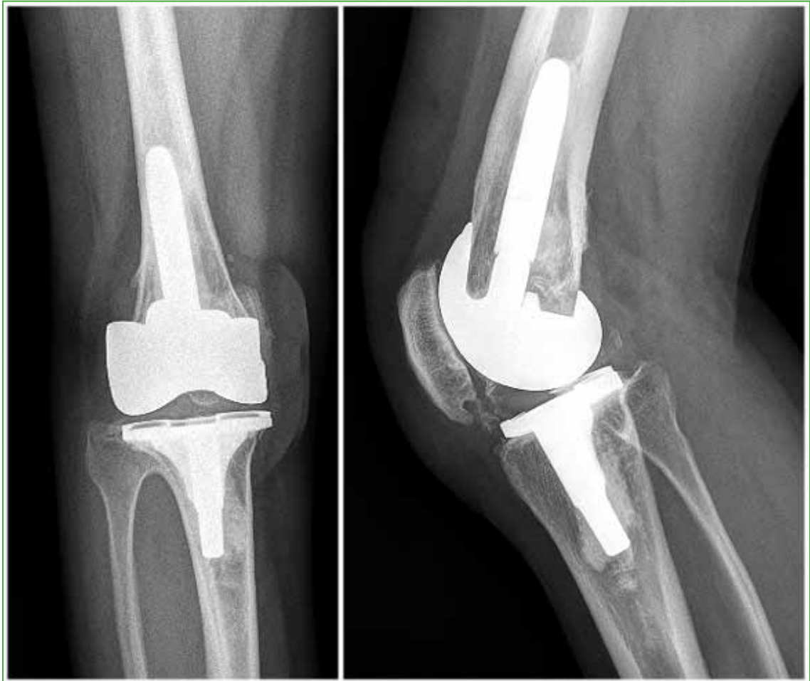
Figure 3. Postoperative anteroposterior and lateral radiograph of the right knee.

Radiographs show no signs of loosening (Figure 3). The KSS on the right knee improved to 86/90. The patient manifests to be satisfied with the results obtained.