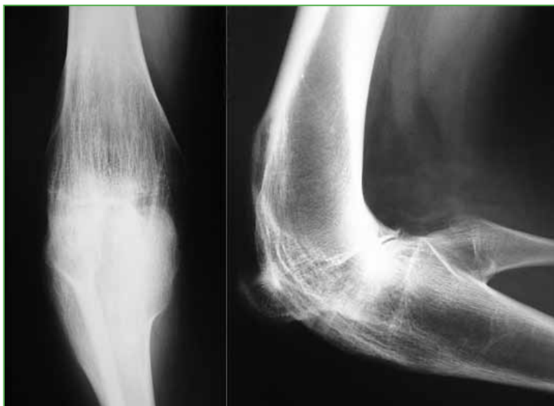
Figure 1. Preoperative anteroposterior and lateral radiograph of the right knee.

An 18-year-old woman with juvenile rheumatoid arthritis and a surgical intervention during childhood. She presented ankylosis of the right knee in 100^\circ flexion, without significant deformity in the coronal plane. The left knee had a range of motion of 90^\circ , with a flexion contracture of 30^\circ . She had difficulty walking, going up and down stairs, and sitting down. The Knee Society Score (KSS) of the right knee measured before surgery was 26/50. On radiographs, both tibiofemoral and patellofemoral bone ankylosis of the right knee could be observed (Figure 1).