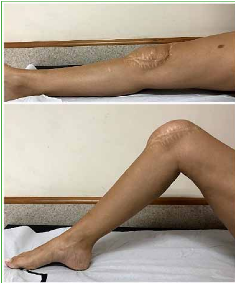
Figure 2. Clinical images of the postoperative range of motion.

At 13 years of follow-up, the patient has a range of motion of 90°, with a full extension (Figure 2).