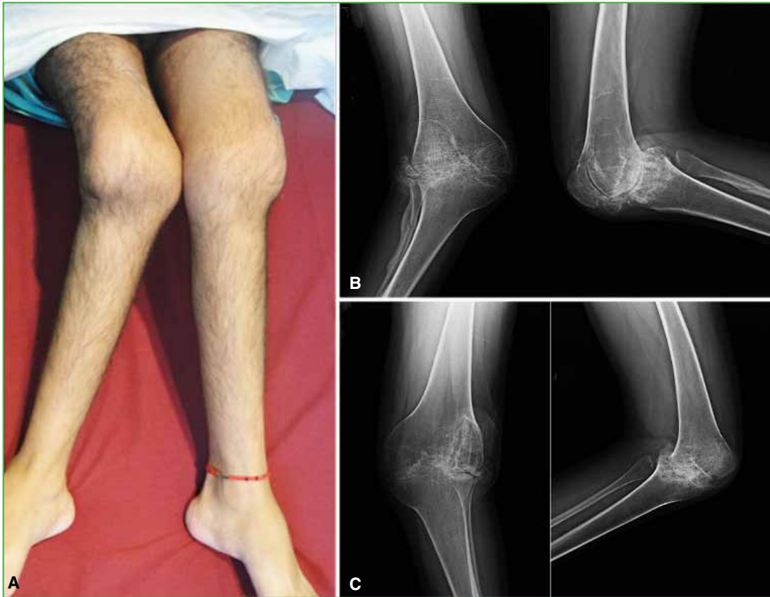
Figure 4. A. Clinical image of both knees showing coronal deformity and ankylosis. B and C. Preoperative anteroposterior and lateral radiographs of the right and left knee.