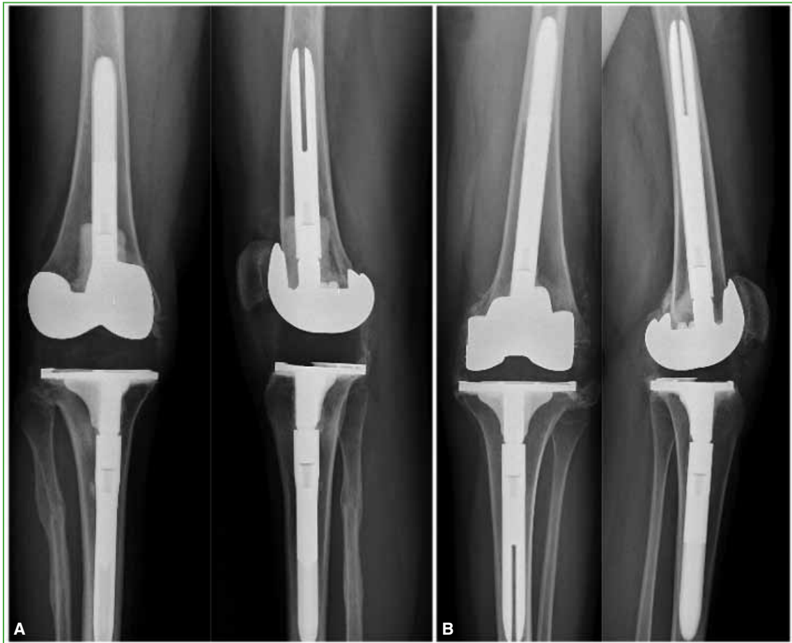
Figure 6. Postoperative anteroposterior and lateral radiographs of the right (A) and left (B) knee.