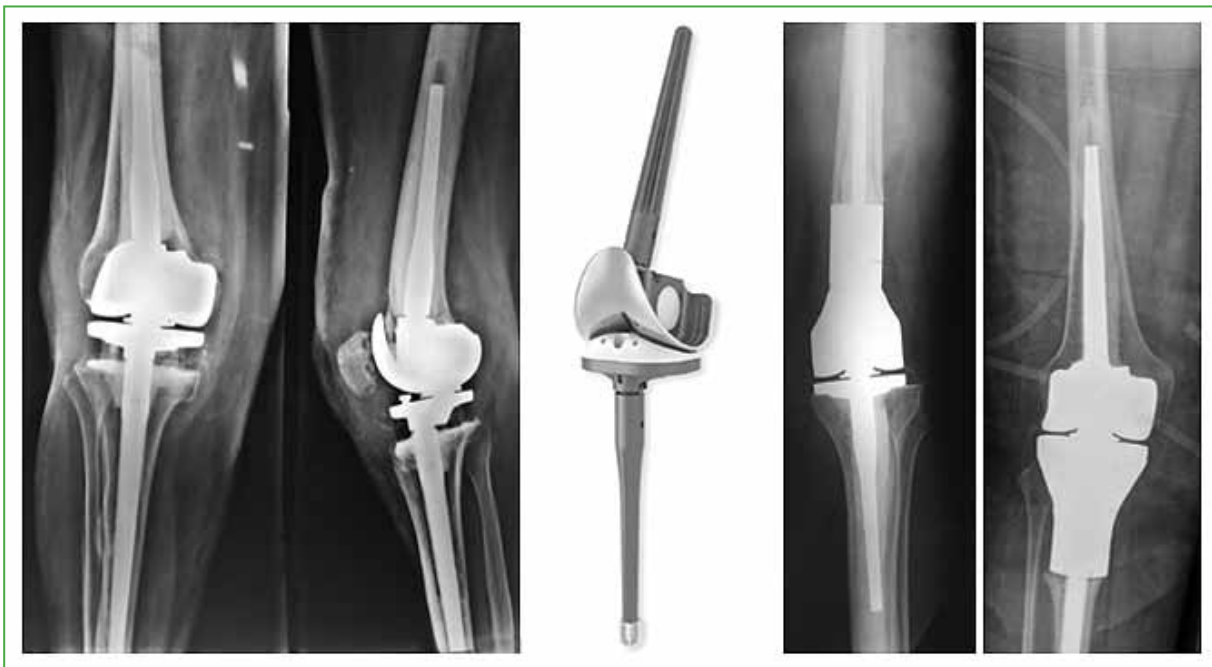
Figure 2. The implant design offers modularity and fixation alternatives. Modularity allows the replacement of femoral and tibial segmental defects. Stems can be “uncemented” and “cemented”.

In the above mentioned paper the implant is already presented with the “registered trademark symbol” (“Endo-Modell®”). (“Scharnierendoprothese Endo- Modell®. Modell mit Zukunft”) 5 (Figures 1 and 2).