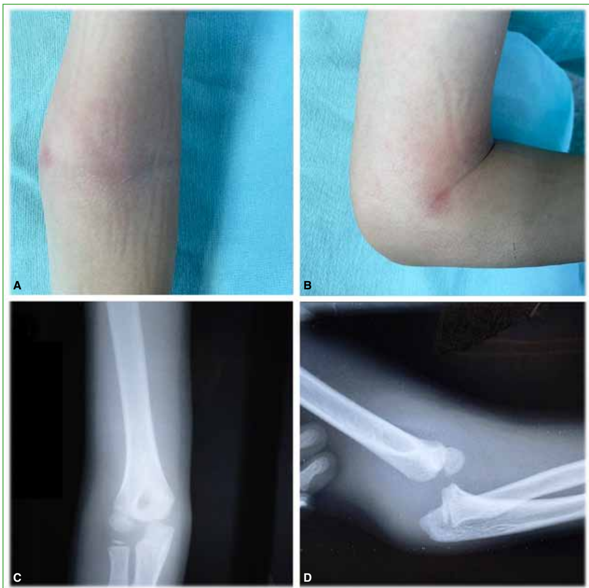
Figure 1. A. Anterior clinical image. B. Lateral clinical image. Elbow radiographs. C. Anteroposterior. D. Lateral.

A 6-year-old boy, without a clinical history, had fallen from a tree with his elbow in hyperextension. Eight hours after the fall, he consulted with the Emergency Department about pain and deformity in his right elbow. In the initial evaluation, a closed injury was observed, associated with lateral and posterior edema and deformity with loss of range of motion. The radial pulse was palpable, the hand had a capillary refill time <2 seconds and there was no sensory deficit. An isolated posterior right elbow dislocation was observed in both the physical examination and the radiographs of the injured elbow (Figure 1).