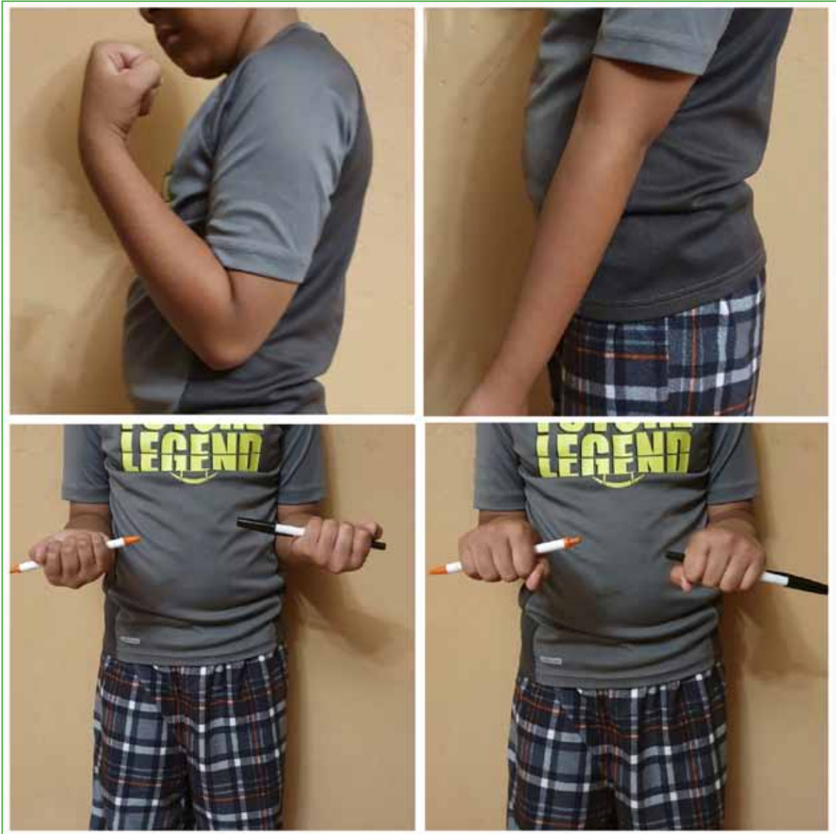
Figure 5. Functional outcomes of Case 2.

Previous studies support that satisfactory outcomes in both cases were determined by the short prolonged immobilization, closed reduction, and absence of associated injuries. 6,11 The immediate indication of open reduction is for open dislocation, a situation that was not present in these patients. 11 The Roberts scale is used to classify clinical and functional outcomes. It presents four outcomes based on symptoms and total motion restriction, the latter is calculated by the missing degrees to the average elbow flexion and extension ranges (Table). In both cases, the outcomes were excellent. 1,5,6