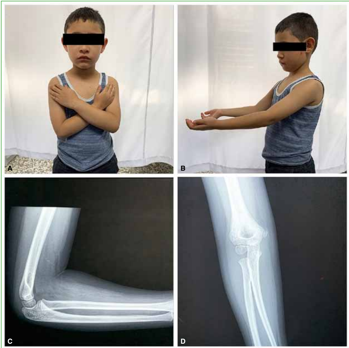
Figure 4. A and B. Functional outcomes of the first case. C and D. Radiographic outcomes of the first case.