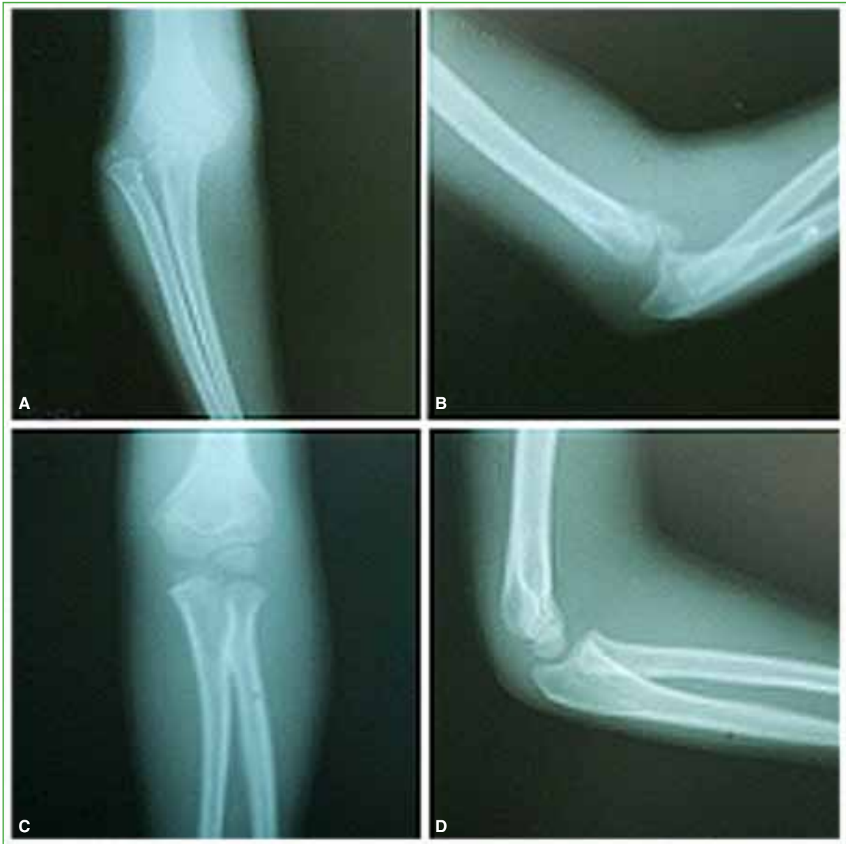
Figure 3. A and B. Anteroposterior and lateral elbow radiographs in the Emergency Department. C and D. Anteroposterior and lateral elbow radiographs after surgery.

An immobilizing long arm fiberglass splint was placed in supination for two weeks. The patient left the operating room in a stable condition. Routine radiographs were taken in congruent orthogonal projections. The boy was discharged two days later. In the follow-up visit two weeks after reduction, the splint was removed and the treating traumatologist initiated passive mobilization immediately afterward. The elbow was left unrestrained; the use of a sling was suggested, depending on the pain, but it was not necessary. At three weeks, elbow flexion was 110^{\circ} and the extension had a 15^{\circ} deficit associated with mild pain. The final outcomes at three months were full flexion of 130^{\circ} and full extension.