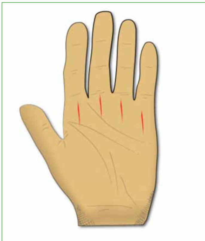
Figure 1. Longitudinal palmar incision at the metacarpophalangeal level.

Through this short story, we share the origin of a surgical technique: the Liberata Surgery . A technique that stems from a deep understanding of hand anatomy and biomechanics as well as a constant search for effective and simple solutions.