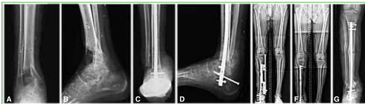
Figure 3. A and B. Anteroposterior and lateral ankle radiographs. The sequela of an open fracture of the tibial pilon is observed which, after multiple surgeries, evolved with loss of joint bone stock. C and D. Anteroposterior and lateral ankle radiographs, after reconstruction through a bone resection of the tibia and distal fibula with acute shortening of the limb and tibiototalcalcaneal arthrodesis with a long nail. E. Scanogram of both lower limbs at the beginning of the lengthening due to callotasis according to the technique. F. Scanogram of both lower limbs. G. Anteroposterior leg radiograph. Final outcome.

He was referred to our institution with a soft tissue defect on the lateral aspect of the right ankle, in addition to long-standing bone and joint exposure. Reconstruction was performed through a bone resection of the tibia and distal fibula with acute shortening of the limb and tibiototalcalcaneal arthrodesis with a long nail. (Figure 3C-D). Given the improvement of the soft tissues, we proceeded with callotasis lengthening according to the technique (Figure 3E). The final outcome can be observed in Figure 3F-G.