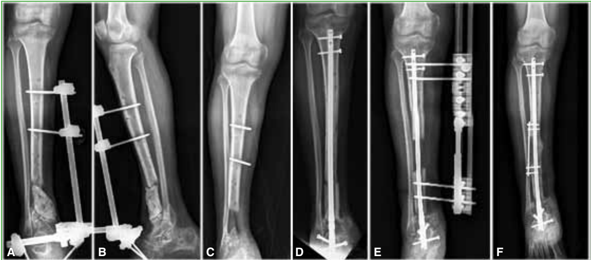
Figure 1. A and B. Anteroposterior and lateral leg radiographs. The focus of nonunion is observed in the distal tibia. C. Anteroposterior leg radiograph after initial debridement. The bone stock deficit is observed. D. Anteroposterior leg radiograph after the placement of an antibiotic-loaded cement spacer and the stabilization with a retrograde tibia nail at the tibioalcanal level. E. Anteroposterior leg radiograph. The reconstruction of the defect with bone transport on a nail is observed. F. After transporting, it was decided to protect the area with a plate and screws.