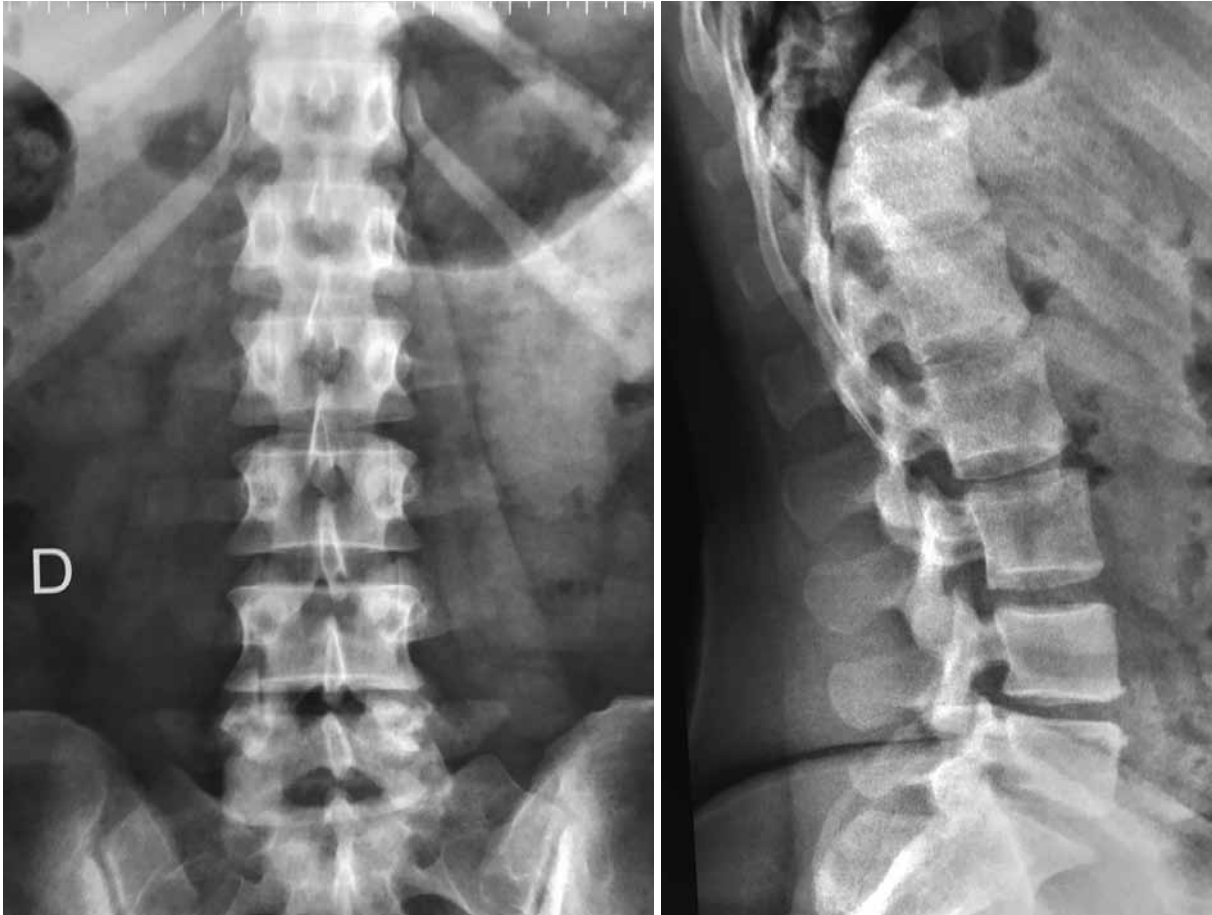
Figure 3. Control radiographs. No remains of the intracanal fragment are observed.

Surgery was carried out with somatosensory and motor evoked potentials, and no alterations were observed. After extraction, imaging studies were performed in order to verify and document the absence of the needle fragment (Figure 3).