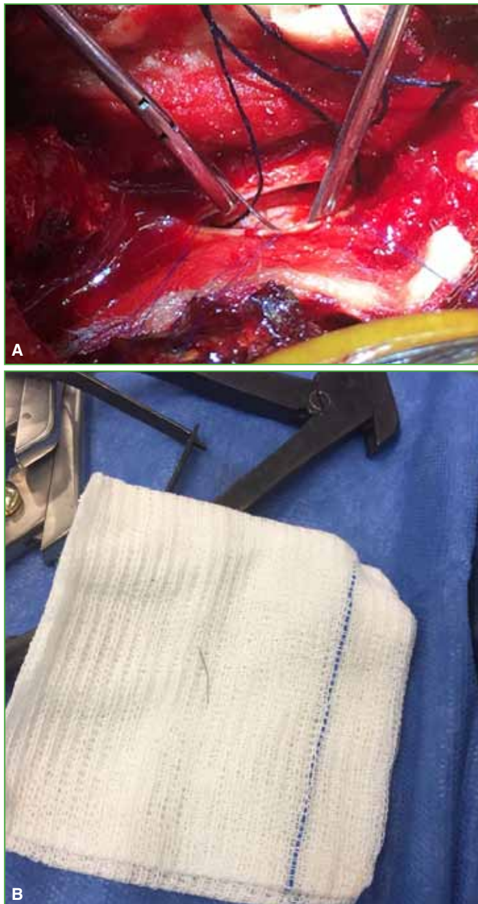
Figure 2. A. Removal of the needle after dural opening. The needle was fixed on the T12-L1 disc. B. Broken needle fragment, sent to regulatory authorities.

Surgical treatment was indicated to remove the needle. Surgery was planned through the posterior dorsolumbar approach, through the midline between T12 and L1, with divulsion of the muscle on the right side. By means of hemilaminectomy, the epidural space was accessed and no element was found compatible with what was visualized in the studies by images. Therefore, we decided to perform a transdural exploration under microscope, and the fragment of the needle was found, fixed in the T12-L1 disc on the right side. The fragment was removed with a pituitary forceps (Figure 2). After the exploration with fluoroscope and verifying that the rest of the needle had been completely extracted, the closure was carried out with 6.0 suture and dural sealant, with a negative Valsalva maneuver. The closure of the wound by planes was completed in a hermetic manner.