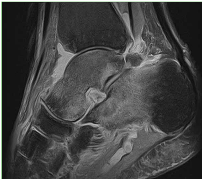
Figure 2. Post-traumatic bone marrow edema in the talar body and the calcaneus.

The most frequent location of bone marrow edema was the talar neck and head (32 patients, 64%), commonly when MRI showed a lateral or medial injury (15 cases, 30%). The second most frequent location was the talar body (20 patients, 40%) (Figure 2).