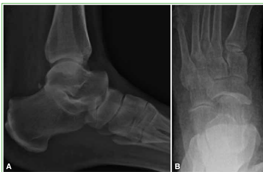
Figure 2. A. Profile radiograph displaying the incongruity in the subtalar and the talonavicular joints. B. Frontal radiograph revealing a medial subtalar dislocation

Radiographs revealed a medial subtalar dislocation, with evident anomalies in the talonavicular and subtalar joints (Figure 2). The CT scan did not reveal associated bone injuries (Figure 3).