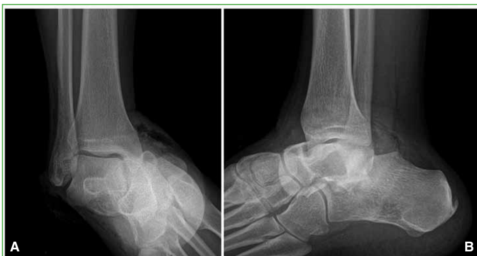
Figure 6. Front ( A ) and profile ( B ) ankle radiographs. Medial subtalar dislocation.

A 43-year-old man with a right ankle injury, suffered after a fall from a height of 1 meter. He attended our ER the same day of the injury, indicating pain, functional impairment and deformity in said ankle. Radiographs showed a pure medial subtalar dislocation ( Figure 6 ), which prompted an urgent reduction procedure under anesthesia ( Figure 7 ).