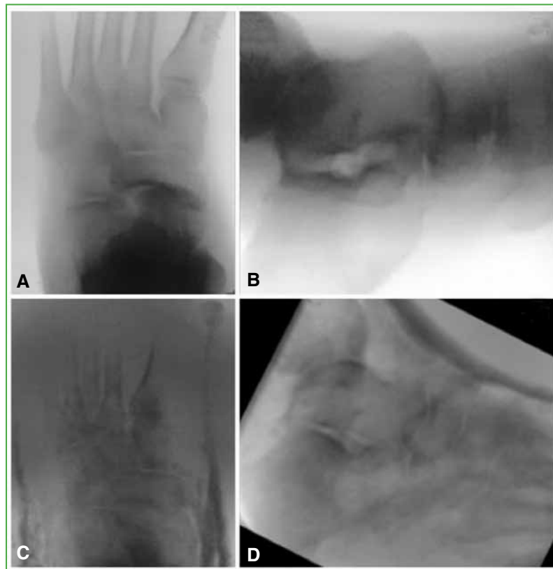
Figure 4. Intraoperative radioscopy. A and B. Previous to the reduction. C and D. After the reduction.

It was decided that an urgent closed reduction was to be performed in the Operating Room under general anesthesia. In order to relax the Achilles tendon, the knee was flexed. A traction technique was applied on the axis, accentuating the deformity, in order to first reduce the impact and then, eversing the foot, a reduction was achieved. The reduction was confirmed through a radioscopy (Figure 4), a short leg plaster cast was applied, and post-operative radiographs were taken. (Figure 5)