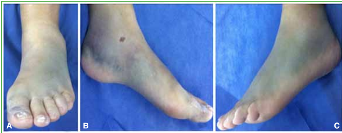
Figure 1. Clinical images of the affected soft tissue and the foot in a plantar flexion with slight supination. A. Frontal. B. Medial C. Lateral.

A 69-year-old woman without relevant medical history attended the ER after suffering high-energy trauma as a result of being rammed by a car. She indicated pain related to the functional impairment of the left foot and ankle. She had first been assisted in a different ER, where she was immobilized with a short leg plaster cast to aid in pain management, but without a conclusive diagnosis. Within the first 24 hours of the injury, she attended our facilities due to persistent pain. She was assisted in an urgent manner. As a first measure, her cast was removed to inspect the skin and soft tissue. The patient suffered from intense pain in her left foot and ankle as a result of edema and bruising. (Figure 1)