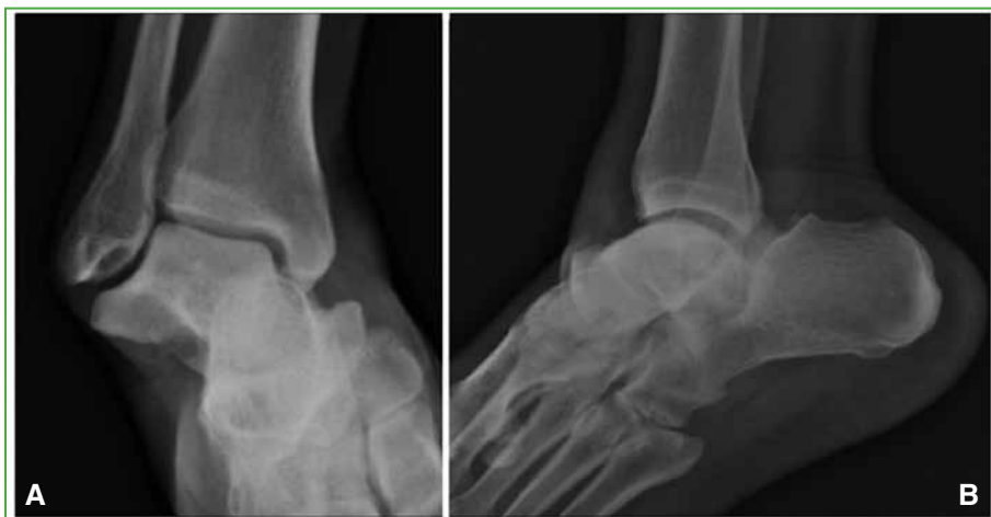
Figure 8. Front ( A ) and profile ( B ) radiographs displaying the medial dislocation.

A 44-year-old man suffering from a sport-related ankle injury. He was brought in by ambulance to our ER, 6 hours after the event. He presented pain, deformity and functional impairment of the right ankle. Radiographs displayed articular incongruity with a medial subtalar dislocation ( Figure 8 ).