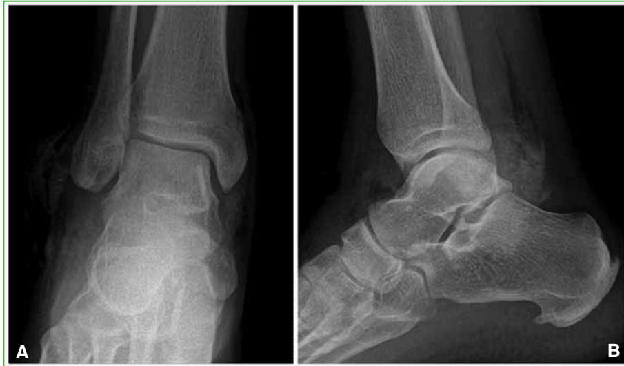
Figure 7. Post-reduction radiographs. A. Front. B. Profile.

He was immobilized with an short leg plaster cast. The immobilization was maintained during the course of 5 weeks, then removed and replaced by a cast brace for two more weeks. By week 6, he was allowed partial weight bearing and progressed to full weight bearing by the third month. In the 12-month follow-up, the VAS score was 2/10, with stable ankle and hindfoot, and the range of motion was fully recovered in contrast to the opposite foot. He indicated feeling slight soreness during sporting activities, and the AOFAS score was 76 out of 100. It is worth mentioning that the patient presented plantar fasciitis during evolution, which was treated with physical therapy stretching exercises and an injection (10mg betamethasone and 2% lidocaine). Symptoms then disappeared.