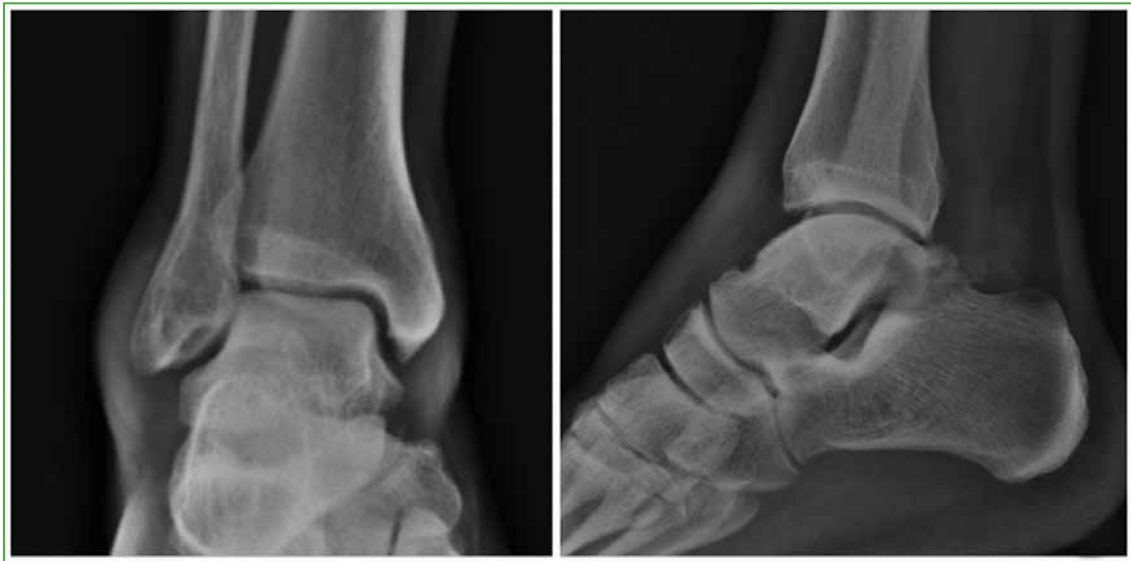
Figure 9. Front (A) and profile (B) radiographs displaying the adequate reduction.

A closed reduction was performed in the Operating Room under anesthesia (Figure 9). He was immobilized with a cast and kept for four weeks, put in a cast brace for two more weeks and indicated to follow the rehabilitation protocol. Partial weight bearing was authorized after week 6, and full weight bearing at 3 months post injury. The patient interrupted the aftercare follow-ups and consulted again after two years, so the 12-month protocol was not maintained. In the long-term follow-up, the VAS score was of 0/10, he did not feel any soreness when performing sporting activities. In the physical examination, full range of motion compared to the other ankle was determined, and the AOFAS score was of 100 out of the 100 maximum.