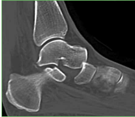
Figure 3. CT scan. The upper edge of the navicular is displaced to the distal position and shows impact in the anterior area of the talus.

It was decided that an urgent closed reduction was to be performed in the Operating Room under general anesthesia. In order to relax the Achilles tendon, the knee was flexed. A traction technique was applied on the axis, accentuating the deformity, in order to first reduce the impact and then, eversing the foot, a reduction was achieved. The reduction was confirmed through a radioscopy (Figure 4), a short leg plaster cast was applied, and post-operative radiographs were taken. (Figure 5)