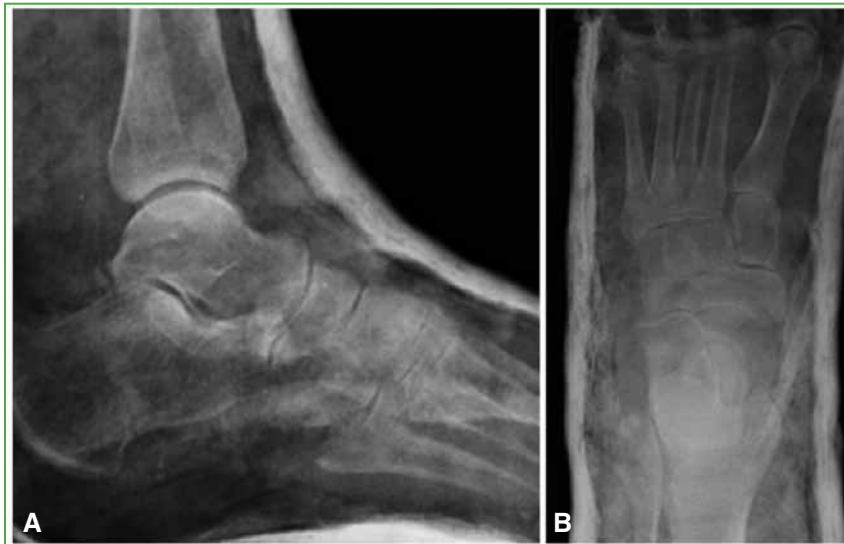
Figure 5. Postoperative radiographs. A. Profile. B. Front.

She was instructed to keep the injury immobilized by the cast for four weeks. Subsequently, the plaster cast was removed and replaced by a cast brace. She was then allowed partial weight bearing starting at week 6. The patient maintained the rehabilitation protocol and she was allowed full weight bearing without restrictions after the third month. 12 months later, a long-term control showed that the patient had no symptoms and was observed to have adequate stability of the hindfoot. The visual analog scale (VAS) score was 0/10, she regained full range of motion in comparison to the opposite foot, and the AOFAS score was of 100 out of 100.