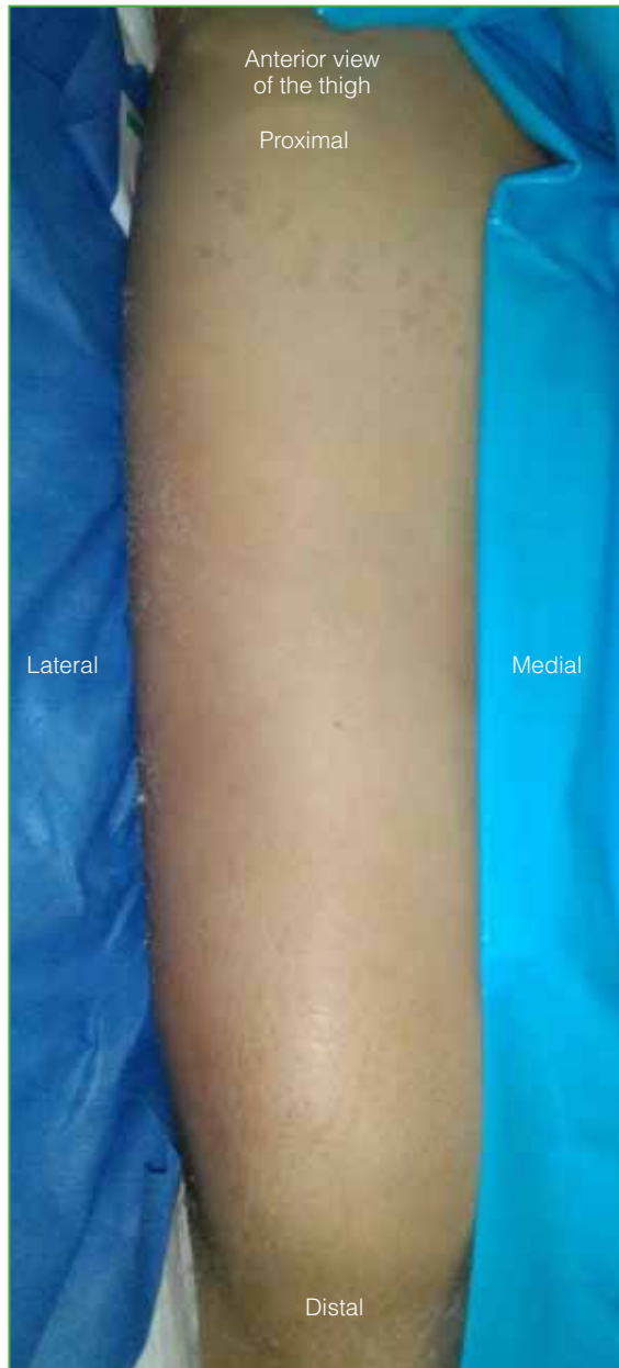
Figure 2. Clinical image of the anterior compartment of the thigh taken on admission.

Upon admittal, his general condition was unfavorable; he was somnolent, feverish and disoriented in time and space. Erythema, heat and crepitations were found on the lateral side of the right thigh, extending from the surgical wound to the medial knee region ( Figure 2 ).