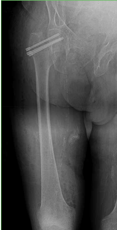
Figure 3. Anteroposterior radiograph of the right femur on admission. Note the alteration of the fracture reduction and the radiolucid images that extend over the soft tissue of the entire thigh. .