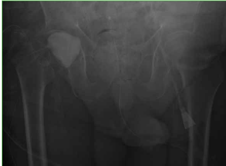
Figure 6. Anteroposterior radiograph of both hips after second surgical debridement associated with Girdlestone procedure and construction of antibiotic-impregnated cement spacer.

Seven days after surgery, a new debridement and Girdlestone procedure were performed, and the osteosynthesis material was removed (Figure 6). The acetabular articular cartilage was resected and a cement spacer with 2 g vancomycin and meropenem was made, according to antimicrobial susceptibility. Currently, the patient's general condition is improving, he is extubated and progressively decreasing his need for inotropic support.