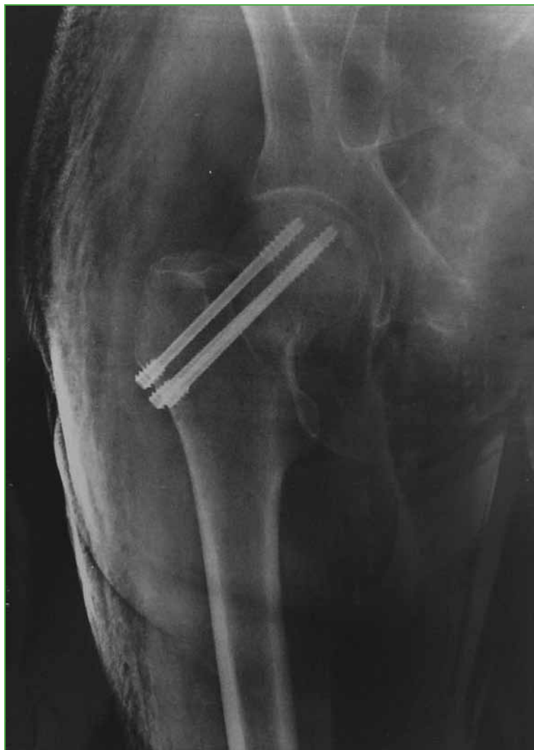
Figure 1. Immediate postoperative anteroposterior radiograph of the right hip.

A 62-year-old patient who had undergone osteosynthesis of the right hip after a Garden 1 femoral neck fracture, 40 days earlier, in another institution (Figure 1). The patient was admitted to our emergency department suffering from septic shock. The patient was awaiting heart and kidney transplantation and presented diabetic nephropathy, hypertension, dilated cardiomyopathy and coronaropathy. 20 days post-surgery, he had cellulitis of the surgical wound. Given the poor response to oral antibiotics, he was admitted to receive intravenous treatment.