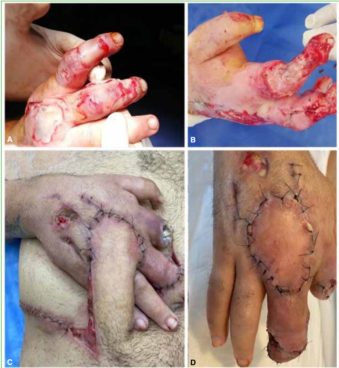
Figure 2. Patient 2. A 36-year old male, with untreated type 1 diabetes mellitus, and an LRINEC score of 9. A. Image shows severe soft-tissue lesions and necrotic lesions. B. Surgical debridement was performed on the dorsal aspect of the hand and involved tissue from the middle and index fingers. The patient had a poor postoperative course, which required further debridement procedures and resulted in index amputation. C. Due to soft-tissue coverage deficit, a groin flap was used to cover the defects. Image also shows problems with the index stump. D. Final outcome.