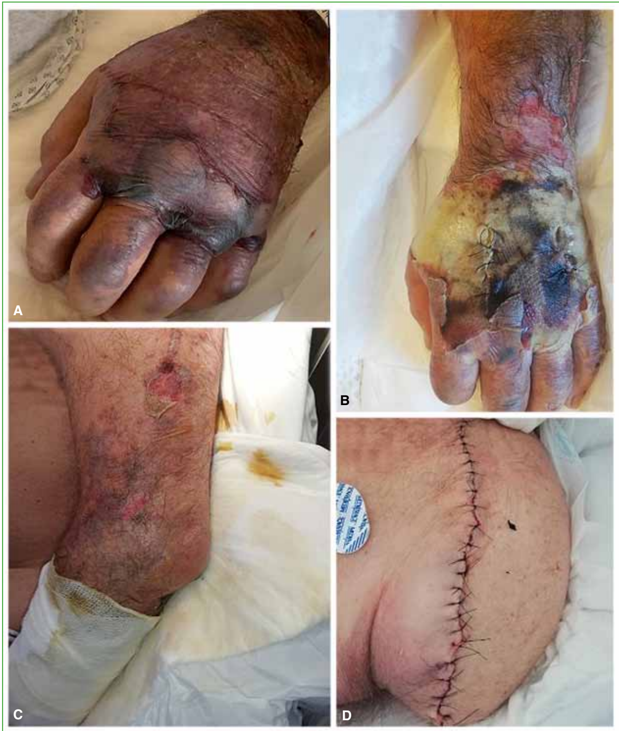
Figure 3. Patient 3. A 71-year old male, with diabetes, renal failure, pacemaker and multiple vascular conditions; LRINEC score of 8. A. Image shows large hemorrhagic blisters, which are considered to be a sign of severe tissue lesions. B. Quick progression to soft-tissue necrosis after the first surgical debridement. An aggressive debridement was later performed. C. The patient had a poor early postoperative course (6h), with enlargement and progression of the edema and hemorrhagic blisters in the upper extremity. D. Upper-extremity disarticulation was performed due to the poor clinical course.