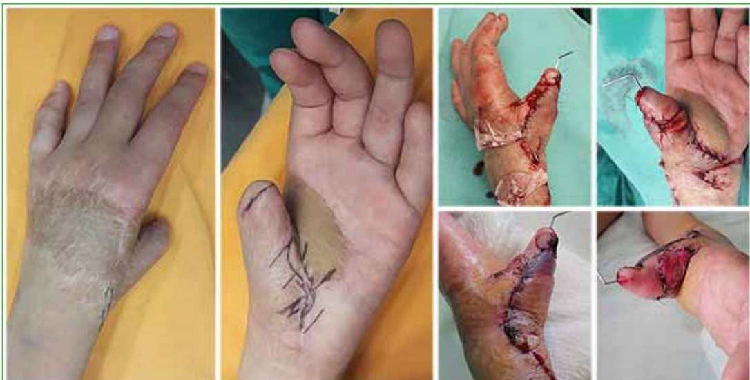
Figure 3. Second surgical stage: reconstruction of the thumb with free transfer of the hemihallux.

After the rehabilitation of the range of motion of the thumb, at eight months, the second surgical stage was carried out, which consisted of reconstruction of the thumb with a transfer of the hemihallux and end-to-side anastomosis to the radial artery and two satellite veins to the veins of the back of the hand (Figure 3).