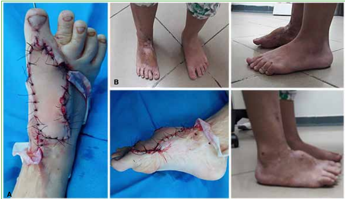
Figure 8. A. Immediate postoperative outcome. B. Outcome at four months, plantigrade support of the foot, without discomfort when wearing closed footwear.