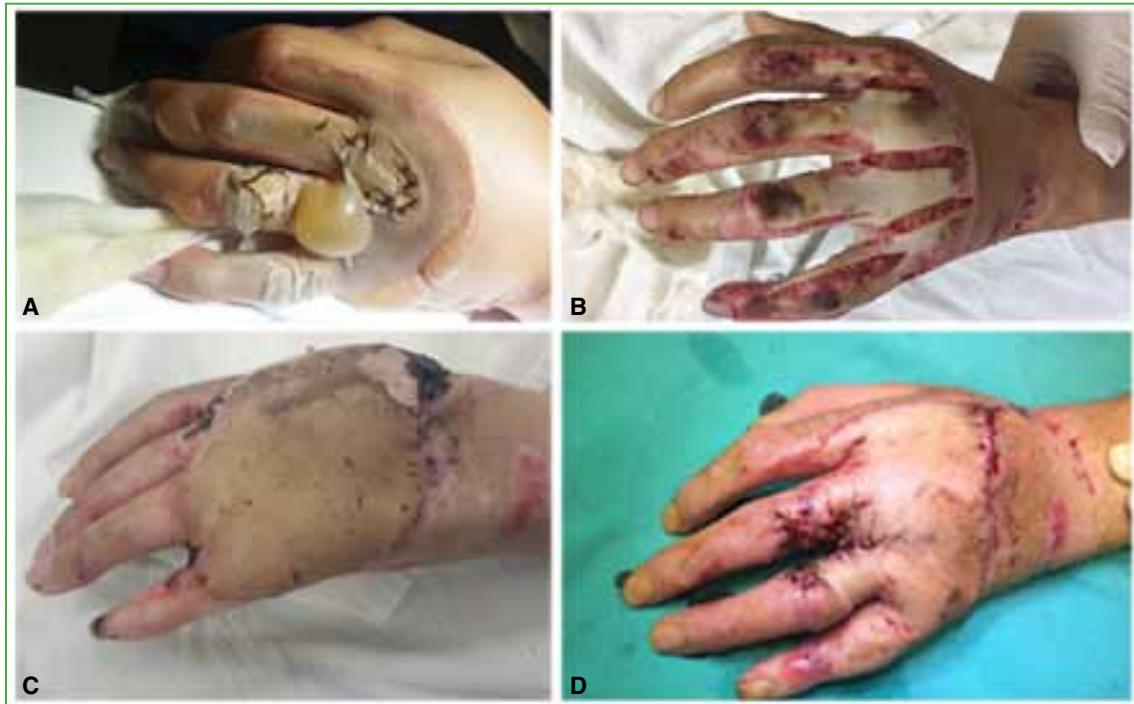
Figure 5. A. Deep burn of the back of the hand and fingers. B. Seven days after longitudinal incisions on the back of the hand and fingers. C. Three weeks after surgery. D. Five weeks after the superficial circumflex iliac artery flap, the commissures were opened.

Resection of the pathological tissue and placement of a thin SCIP flap, based on the superficial branch, was planned three weeks after the burn. Due to the need for a long pedicle to construct the radial artery anastomosis, a 14 x 7 cm distal skin flap was carved, in which the superficial perforator pedicle was embedded in a fatty flap. The anastomosis was end-to-side to the radial artery and two veins to the dorsal veins of the hand and wrist. The flap covered the entire dorsal defect and the metacarpophalangeal region of the fingers. After three weeks, the syndactyly was separated at the second and fourth commissures, and at the fifth week, the third commissure was separated. At the eighth month after the operation, the range of motion and function of the hand were complete, with an acceptable aesthetic appearance (Figure 6).