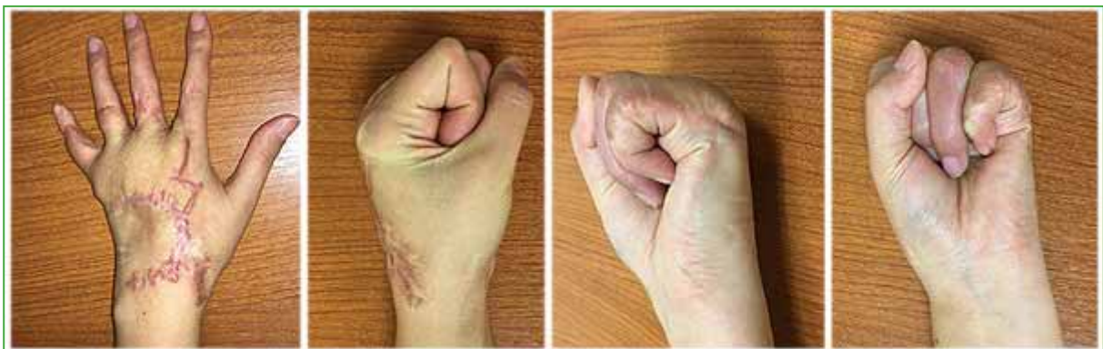
Figure 6. Eight months after surgery, the mobility of the hand is complete and the cosmetic result is excellent. A thin flap that does not require subsequent defatting.

Resection of the pathological tissue and placement of a thin SCIP flap, based on the superficial branch, was planned three weeks after the burn. Due to the need for a long pedicle to construct the radial artery anastomosis, a 14 x 7 cm distal skin flap was carved, in which the superficial perforator pedicle was embedded in a fatty flap. The anastomosis was end-to-side to the radial artery and two veins to the dorsal veins of the hand and wrist. The flap covered the entire dorsal defect and the metacarpophalangeal region of the fingers. After three weeks, the syndactyly was separated at the second and fourth commissures, and at the fifth week, the third commissure was separated. At the eighth month after the operation, the range of motion and function of the hand were complete, with an acceptable aesthetic appearance (Figure 6).