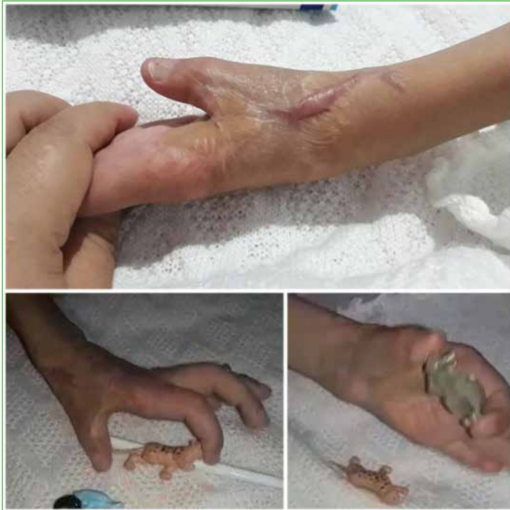
Figure 4. Excellent aesthetic and functional outcomes of the thumb. Note the keloid scar in the dorsoradial region of the wrist.

One year after surgery, the cosmetic appearance and the function of the thumb (Kapandji 8) are good. The only complication is a keloid scar on the back of the wrist (Figure 4).