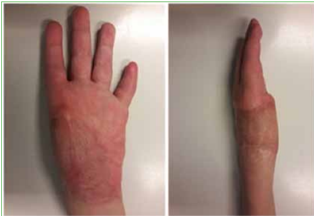
Figure 1. Sequela of injury by dough sheeter machine. Thumb avulsion with distal amputation at the level of F2, type III, with complete inclusion of the thumb in the palm.

A 6-year-old male who suffered an accident in his parents' bakery with the dough sheeter machine, which caused a complete degloving of the thumb and the back of the hand, and a type III amputation of the Allen and Dautel classification (distal to the interphalangeal joint). He was treated through different surgeries at a local hospital. One year after the accident, he was brought to our office. During the evaluation, we observed that the thumb was fully enclosed within the hand and that half of the distal phalanx of the thumb was missing (Figure 1).