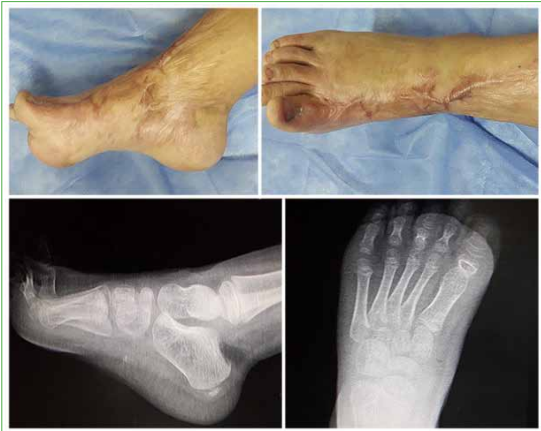
Figure 7. Burn sequela. Cutaneous retraction of the dorsum of the foot with a fixed 90° metatarsophalangeal joint extension deformity.

A 5-year-old girl with a sequela of three years of evolution of a burn with boiling water on the back of her right foot, which caused skin retraction and hallux deformity in fixed extension at 90°. She was subjected to multiple Z-plasties and corrections to no avail. For 30 months, the patient had been unable to put on a shoe due to residual deformity (Figure 7).